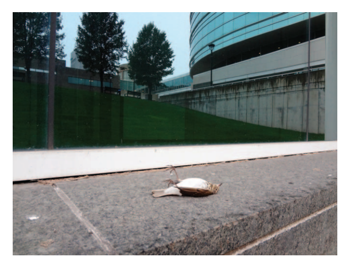
FIGURE 1. A Swainson's Thrush killed by colliding with the window of a low-rise office building on the Cleveland State University campus in downtown Cleveland, Ohio.

Research on bird-building collisions typically occurs at individual sites with little synthesis of data across studies. Conclusions about correlates of mortality and the total magnitude of mortality caused by collisions are therefore spatially limited. Within studies, mortality rates have been found to increase with the percentage and surface area of buildings covered by glass (Collins and Horn 2008, Hager et al. 2008, 2013, Klem et al. 2009, Borden et al. 2010), the presence and height of vegetation (Klem et al. 2009, Borden et al. 2010), and the amount of light emitted from