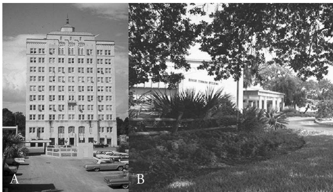
Fig. 2. The Seagle Building (A) and Doyle Conner Building (B) in Gainesville, Florida successively housed the State Plant Board.

In addition to intentionally introducing insects for whatever purpose, some pests have arrived accidentally on agricultural products. The gypsy moth, Lymantria dispar (L.), was imported into the Northeast from Europe in about 1869 to improve silk production. Egg masses are routinely found in Florida on campers and travel trailers that arrive in the fall from infested areas. However, due to Florida's warm climate, this pest does not become established. The European corn borer, Ostrinia nubilalis (Hubner), was accidentally introduced in about 1908 on broomcorn from Italy or Hungary. By 1938, it had spread over practically all of New England. It reached the Florida Panhandle in 1975 when it was found in seven counties by DPI inspectors. The Japanese beetle, Popillia japonica Newman, was introduced into