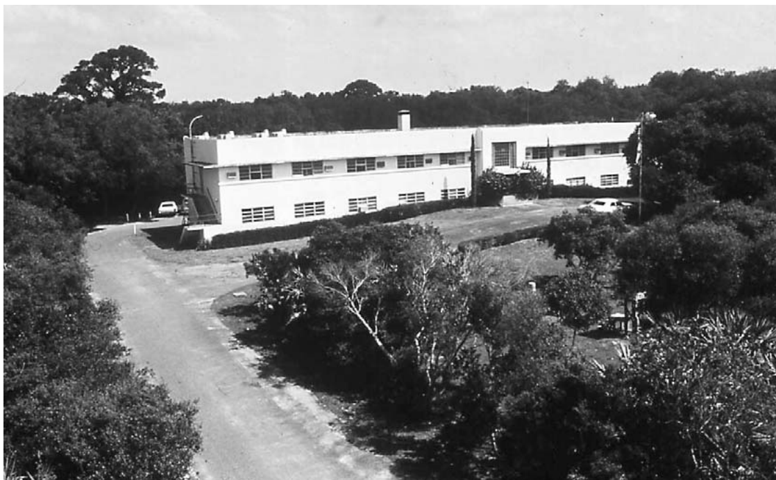
Fig. 3. The Florida Medical Entomology Laboratory at Vero Beach, Florida, as dedicated in 1957.