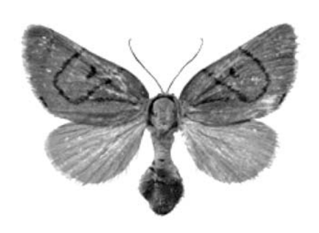
Fig. 1. Camptoloma kishidai sp. nov. : Female, holotype, upperside.

Antemedian, postmedian and discocellular fasciae distinct and well defined, the former two straight, nearly parallel to each other, and with their lower ends connected by a longitudinal dark fascia; discocellular fascia short, curved inwardly, placed nearer to antemedian fascia than to postmedian fascia; submarginal fascia obsolete, traceable; longitudinal fascia on the lower basal wing straight and with its distal end nearly arriving the lower part of antemedian fascia; marginal fascia and tornal reddish patch that represented in other Camptoloma species completely untraceable; cilia orange red. Hindwing ground color