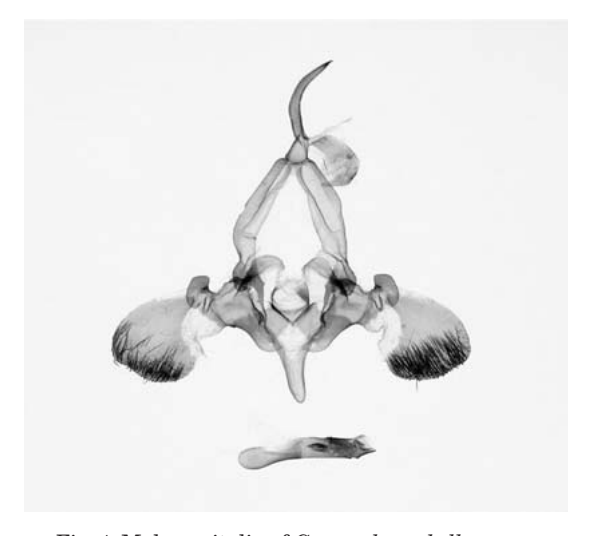
Fig. 4. Male genitalia of Camptoloma bella sp. nov.

The new species is related to C. binotata Butler in appearance, but the characteristics of reddish