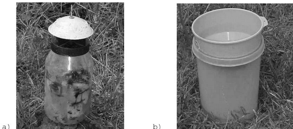
Fig. 1. Traps used for capturing the tuberose black weevil S. acupunctatus : a) Victor trap, and b) Funnel trap.

Fieldwork was conducted from August to October, 2001, in Morelos, México (18°53'N-99°11'W) at an altitude of 1350 m. A 1.2-ha parcel planted with offshoots of P. tuberosa was used as an experimental field and was divided into 18 plots (28 × 35m), with one trap placed in the center of each plot. A two-factor design (two trap types and two bait types) including six treatments and three replicates was used. The traps evaluated were the Victor (V) trap made of transparent plastic measuring 9 × 16 × 7 cm (depth:height:width) with a black cap having four 1 cm-diameter orifices at its base and with a yellow umbrella-shaped cap measuring 7 cm in diameter (Fig. 1a) and a yellow