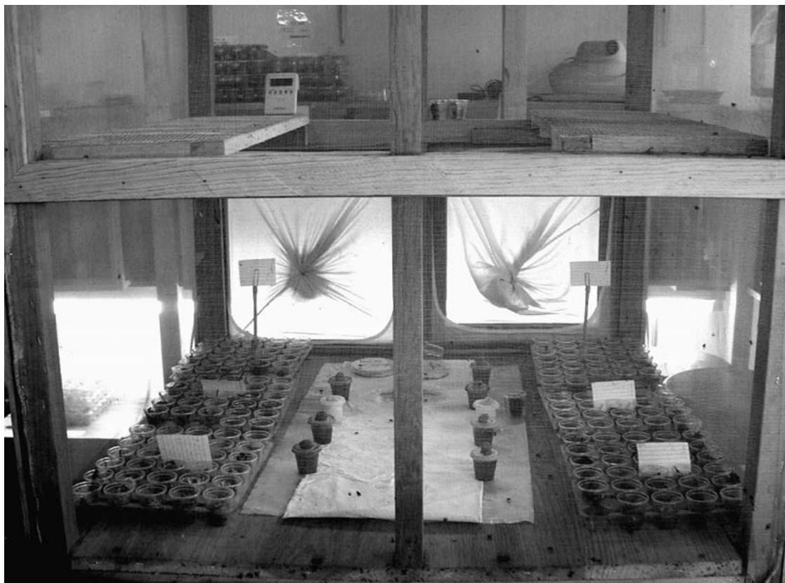
Fig. 3. Fly exposition cage holding rearing trays with 30-ml plastic cups containing a portion of Tillandsia standleyi stem infested with third-instar Metamasius quadrilineatus for parasitism. The Petri dishes containing puparia and cups with hummingbird food and water can be seen in the center of the cage.

was reached, averaging 22 \pm 12.2 fly puparia/day, or approximately 154 puparia weekly. Levels of parasitism averaged 85% (maximum = 90%, minimum = 75%) for 3 trays of 30 weevil larvae each. Emergence of mature fly larvae from hosts was observed as soon as 9 days and continued until 26 days after introduction into the exposition cage. However, approximately 83% of the mature fly larvae emerged 13-16 d after introduction of hosts into the exposition cage. This continuous production level is enough to supply flies for research and field releases.