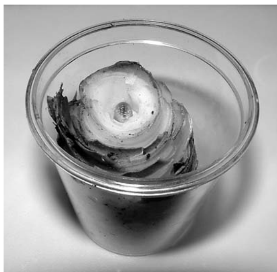
Fig. 1. Third-instar Metamasius quadrilineatus in a portion of Tillandsia standleyi stem in which a 0.5 cm diam. hole was bored to accommodate the insect.

The first experiment was designed to investigate fly preference for weevil larvae feeding on intact plants versus excised stems. The treatments were as follow: (1) weevil larvae were placed individually in the stem of an intact plant by using a 15-cm nail to cut a hole (0.5 cm diameter, 1 cm deep) into the side of the base of the plant and gently inserting the larva into the hole; (2) weevil larvae were placed individually in bare stems (no leaves or roots) by using a nail to cut a hole (0.5 cm diameter, 1 cm deep) into one end of the stem and gently inserting the larva into the hole (Fig. 1). Twenty-eight weevil larvae in each treatment were exposed to >8-day-old flies for 7 d immediately after being put in the plant material. After this exposure period, weevil larvae were removed from the plants or stems and placed individually in 30-ml clear plastic cups fitted with screened lids. Larvae were fed portions (2 cm thick) of T. standleyi stem as needed (usually every 3-4 d) to ensure larvae always had healthy plant tissue on which to feed until parasitoid emergence or weevil pupation. Differences in proportions of parasitized and unparasitized weevil larvae in each treatment were analyzed with a 2