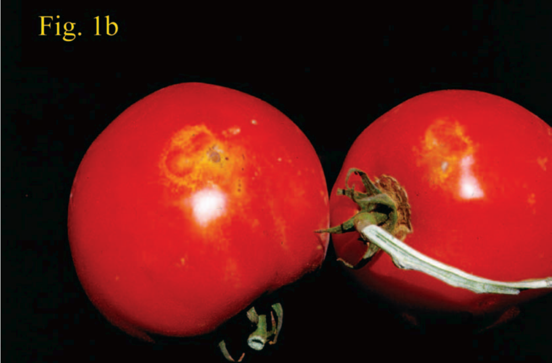
Fig. 1. (a) Goldflecks on tomato caused by feeding of F. occidentalis (Pergande). (b) Goldfleck rings on tomatoes at the spot they were touching each other, caused by feeding of F. occidentalis (Pergande).