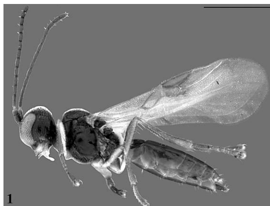
Fig. 1. Holotype of Chaenusa glabra , lateral habitus, scale bar = 500 \mu m.

Diagnosis. —The following combination of characters differentiate C. glabra , Chaenusa bergi (Riegel), and C. rugosa from all other species of Chaenusa : labial palpus 2- or 3-segmented; forewing stigma broad, differentiated from vein R1 distally; forewing vein RS+M absent; forewing first subdiscal cell open; and gonoforceps roughly triangular in lateral view. Other species of Chaenusa have the aforementioned features but in combination with at least one of the following: labial palpus 4-segmented; stigma elongate, distal margin tapering into R1; RS+M at least partially present; first subdiscal cell closed; and gonoforceps boot-shaped in lateral view. Chaenusa glabra is most similar morphologically to the Nearctic species C. bergi and C. rugosa . The labial palpus is 2-segmented in C. glabra and is 3-segmented in C. bergi and C. rugosa . Chaenusa glabra females and males have 10-12 and 12-15 flagellomeres, respectively. Chaenusa bergi has 14-15 and 17-20