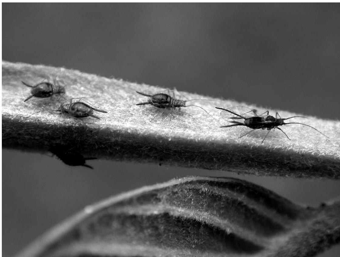
Fig. 1. Viviparous apterae and alatae of Greenidea psidii on Psidium guajava .

The apterae of Greenidea ( Trichosiphum ) psidii van der Goot 1916 (Fig. 1) are dark brown with long yellowish-brown siphunculi, apically curved outwards. There is a complete description, under the name Greenidea formosana (Maki), in Sugimoto (2008). They live on young shoots and undersides of leaves of species of Myrtaceae (mainly Psidium guajava L., but also on species of Callistemon , Eucalyptus , Eugenia , Malaleuca , Metrosideros , Rhodomyrtus , Syzygium and Tristania ); also, samples identified as this species have been recorded on other plants such as Ficus (Moraceae), Glycosmis (Rutaceae), Scurrula (Loranthaceae), Lagerstroemia (Lythraceae), Nesua (Clusiaceae), Rhamnus (Rhamnaceae) and Engelhardtia (Juglandaceae) (Halbert 2004; Blackman