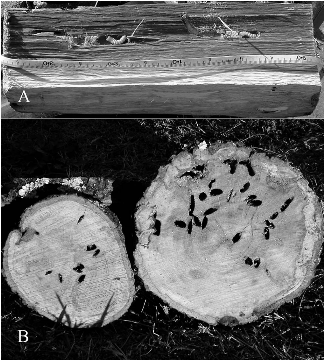
Fig. 1. Early-instar red oak borer larva phloem gallery (A) and cross-section of red oak borer xylem galleries (B).

All areas were systematically visited before red oak borer adult emergence, and potential sample trees were categorized into 1 of 3 infestation-history classes based on a rapid estimation procedure (Fierke et al. 2005b). This procedure was designed to estimate red oak borer infestation severity as a function of red oak borer emergence holes in the basal 2 m of the tree and visual estimates of percent crown dieback. Trees were felled at each site, cut into 0.5-m long bolts, beginning 0.5 m above