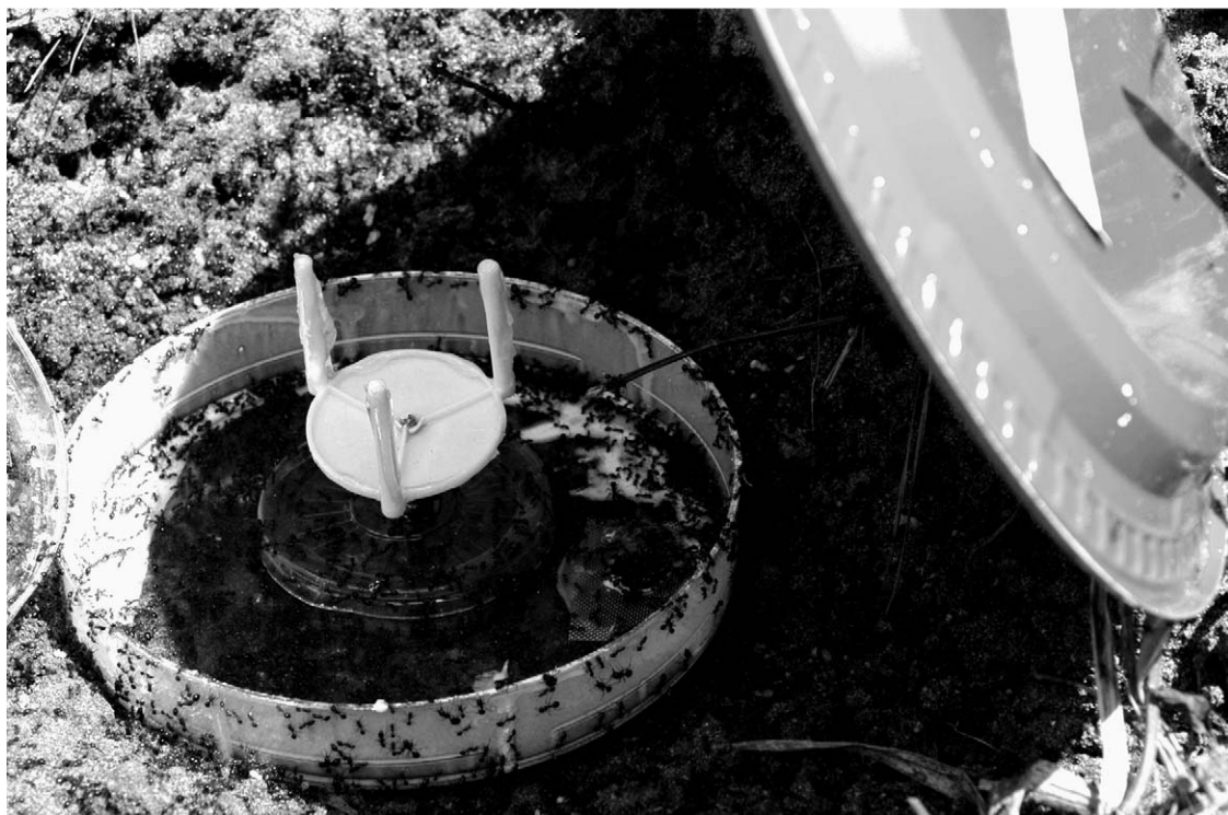
Fig. 1. The fly trap used in this survey was based on traps developed by Puckett et al. (2007) and LeBrun et al. (2008). It consisted of a white tri-stand top coated with Tanglefoot® attached to a slightly larger base by a bolt. The trap was placed inside a large fluon coated Petri dish filed with ants that swarmed into it after being placed into a disturbed mound. Flies were attracted to the disturbed ants and trapped when they landed to rest on the sticky tri-stand.

The trap was placed in the bottom half of a Petri dish (25 by 150 mm). The inside edges of this dish were coated with Fluon® and the Petri dish was settled into a disturbed fire ant mound so it acted like a pitfall trap rapidly collecting 1-10 gm of agitated ants as they swarmed out in defense of their mound. Once trapped in the Petri dish, the ants could no longer retreat into the mound. The ants usually remained in the Petri dish for 2-8 h