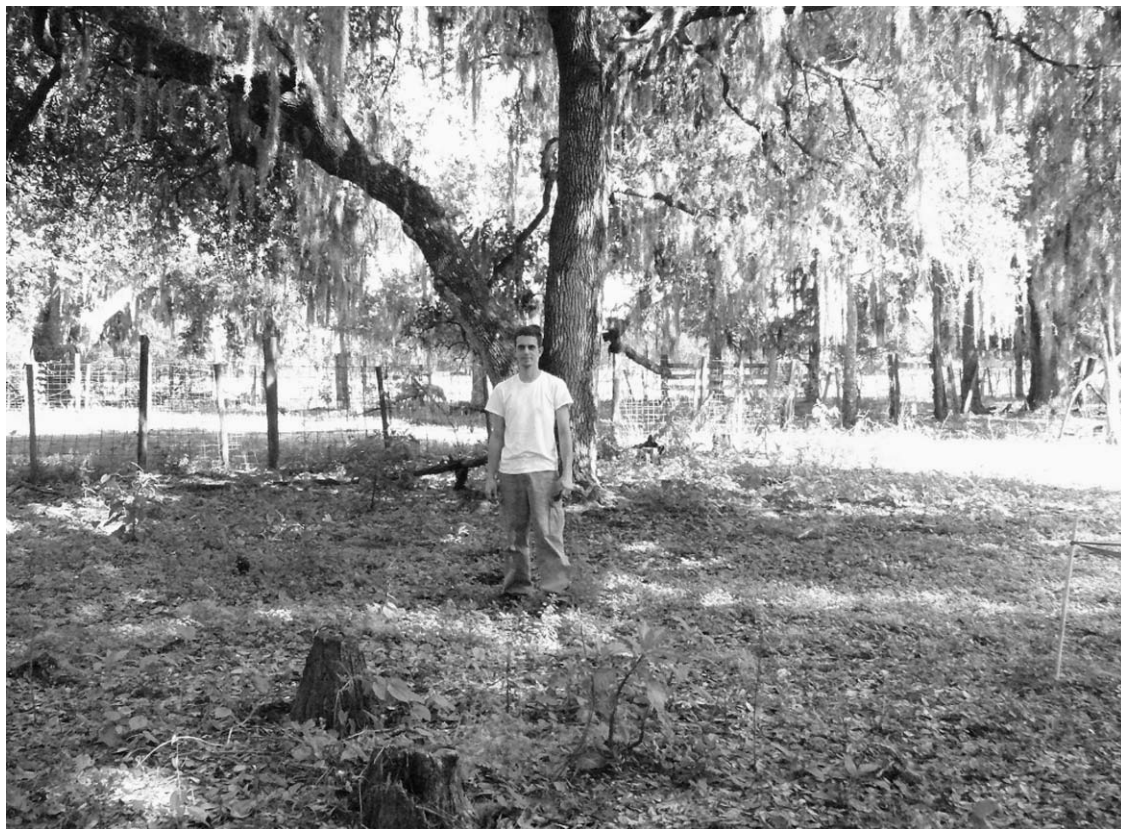
Fig. 4. Site of former Tropical soda apple stand in Polk County, Florida, USA in April 2008. In Aug 2003 Gratiana boliviana beetles had been released at this site. During the intervening yr tropical soda apple coverage of the surface was reduced to 0%.

South Africa for managing the non-native invasive plant Solanum sisymbirifolium Lam. A South-American leaf-feeder beetle, Gratiana spadicæa (Klug) (Coleoptera: Chrysomelidae), released in South Africa in 1994, became established; however, its effect on the target weed has not been as successful as G. boliviana on tropical soda apple in Florida due to different biotic (predation), abiotic (climate), and management (burning regimes) factors at the release sites in South Africa (Olckers 1996; Byrne et al. 2002).