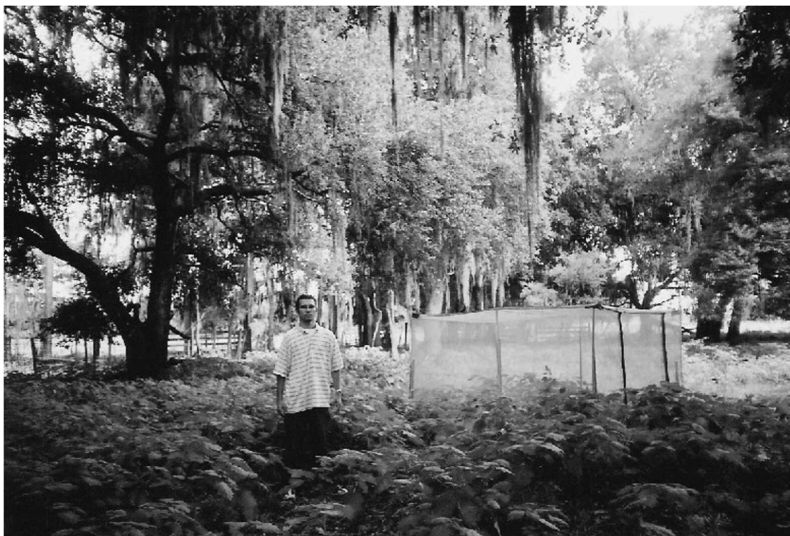
Fig. 3. Tropical soda apple stand before Gratiana boliviana beetles were released. Tropical soda apple covered 100% of the surface. Polk County, Florida, USA, May 2003.

abundance of potential predators at the release sites such as the green lynx spider, Peucetia viridans (Hentz), observed preying on adult beetles, and the red imported fire ants, Solenopsis invicta Buren, observed preying on small and large larvae, this biocontrol agent was capable not only of surviving but of rapid population increase and dispersal to target plants elsewhere. The most likely explanation for the relatively low numbers (average <5 per plant) of beetles recorded on the 20 marked tropical soda apple plants during 2005 was due to the beetles' dispersal from the initial release site to tropical soda apple plants as far as 1,600 m away observed in Sep 2005. Dispersal of the beetles can be attributed to the lack of tropical soda apple foliage caused by the beetle feeding on the target plant since they were released in the previous growing season. Dispersal ability of G. boliviana adults is similar to that of other chrysomelids monitored in weed biocontrol programs (Grevstad & Herzig 1997; DeLoach et al. 2007), or even greater (1.6-16.0 km/year) as indicated by dispersal assessment conducted throughout Florida since 2003 (Medal et al. 2008; Overholt et al. 2009, 2010).