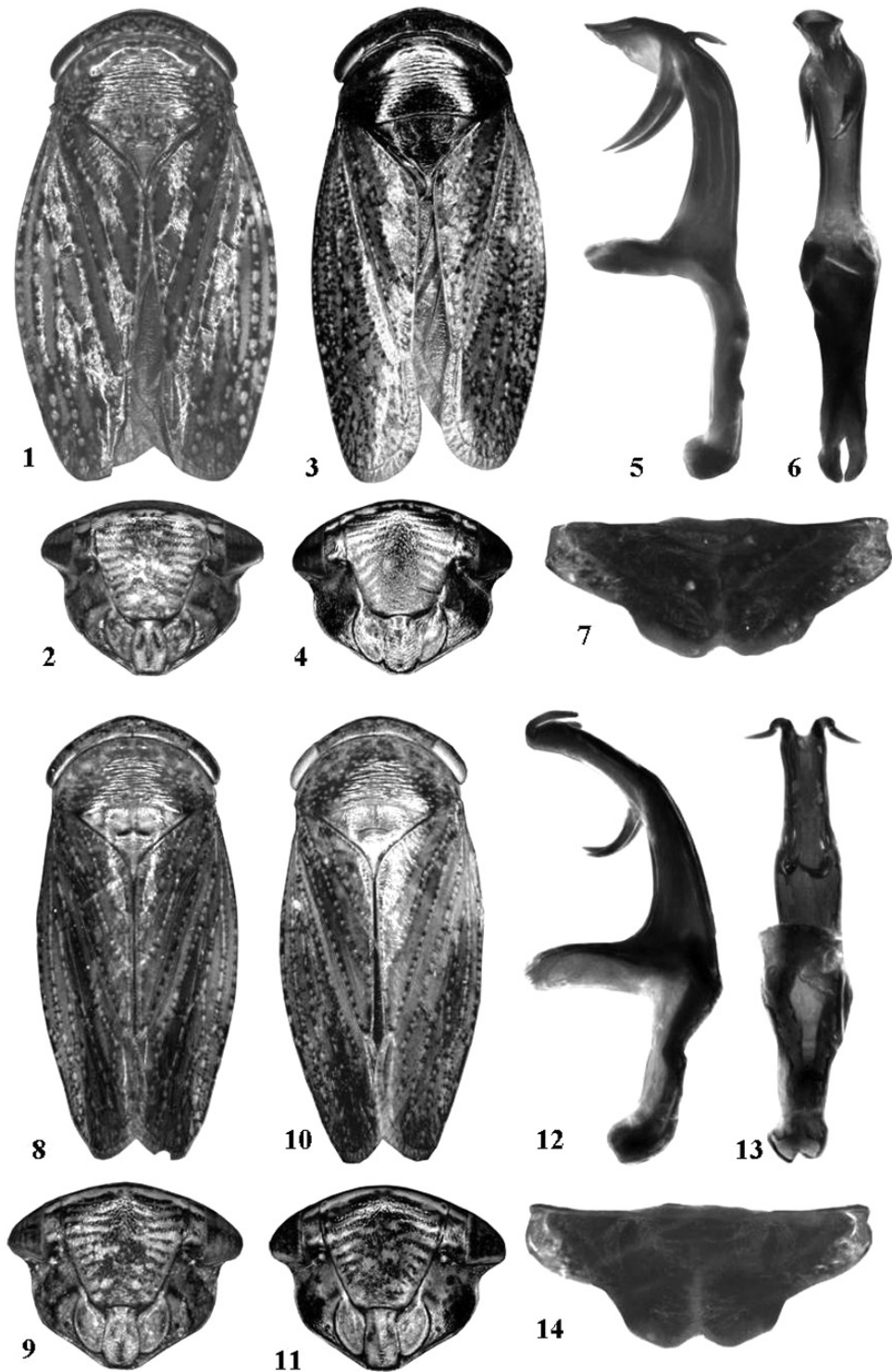
Figs. 1-14. Species of Goniagnathus ( Tropicognathus ). (1-7) Goniagnathus ( Tropicognathus ) keralaensis sp. nov. ; (1-2) Male; (1) Habitus; (2) Face; (3-4) Female; (3) Habitus; (4) Face; (5) Aedeagus, lateral view; (6) Aedeagus, dorsal view; (7) Female seventh sternite; (8-14) Goniagnathus ( Tropicognathus ) punctifer ; (8-9) Male; (8) Habitus; (9) Face; (10-11) Female; (10) Habitus; (11) Face; (12) Aedeagus, lateral view; (13) Aedeagus dorsal view; (14) Female, seventh sternite.