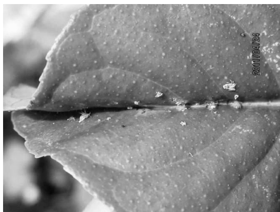
Fig. 3. Pomelo psyllid nymphs feeding inside the fold along the main vein.

HLB-symptomatic lemon trees and examined in the laboratory under a microscope. These nymphs were then preserved in 70% ethanol. All nymphs from a single tree were placed together in a bottle and labeled. The mature and HLB-symptomatic leaves from the trees where the nymphs had been collected were also collected and labeled for confirmation of HLB in the laboratory.