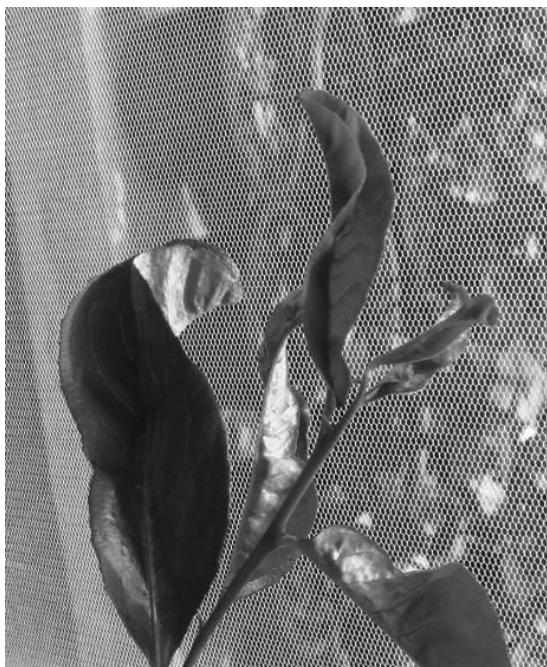
Fig. 2. Damage phenotypes of the pomelo psyllid, Cacopsylla (Psylla) citrisuga Yang & Li. The adults lay eggs around the main vein of the upper side of the young leaves. The nymphs feed on the young leaves and the infected leaves become folded.

HLB-symptomatic lemon trees and examined in the laboratory under a microscope. These nymphs were then preserved in 70% ethanol. All nymphs from a single tree were placed together in a bottle and labeled. The mature and HLB-symptomatic leaves from the trees where the nymphs had been collected were also collected and labeled for confirmation of HLB in the laboratory.