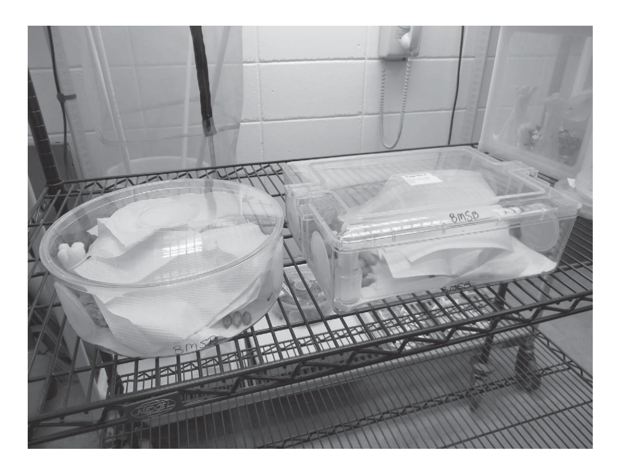
Fig. 1. Clear plastic rectangular and circular containers for rearing Halyomorpha halys.

significantly improved the BMSB rearing success. Other foods occasionally added to the diet included raisins [Vitis vinifera L. (Vitaceae)], apple [Malus pumilla Mill. (Rosaceae)], papaya [Carica papaya L. (Caricaceae)], mango [Mangifera indica L. (Anacardiaceae)], okra, orange [Citrus sinensis (L.) Osbeck (Rutaceae)], tangerine [Citrus tangerine (Tanaka) Tseng (Rutaceae)], cucumber [Cucurbita sativus L. (Cucurbitaceae)], jalapeño [Capsicum frutescens L (Solanaceae)], tomato [Lycopersicon esculentum Mill. (Solanaceae)], strawberry [ Fragaria \times ananassa (Rosaceae)], common ragweed [Ambrosia artemisiifolia L. (Asteraceae)] bouquets and other seasonal produce. Layers of Kimwipes® Kimberly-Clark and paper towels were placed inside the containers to provide an oviposition substrate, hiding places, and additional surface area. Egg masses were hand collected every other d. This method proved to be very effective for obtaining fresh high quality eggs (Fig. 2). To avoid egg predation by adults and to avoid overcrowding, egg masses were collected regularly and placed in a separate labeled container. Nymphs tended to feed on the eggs, and