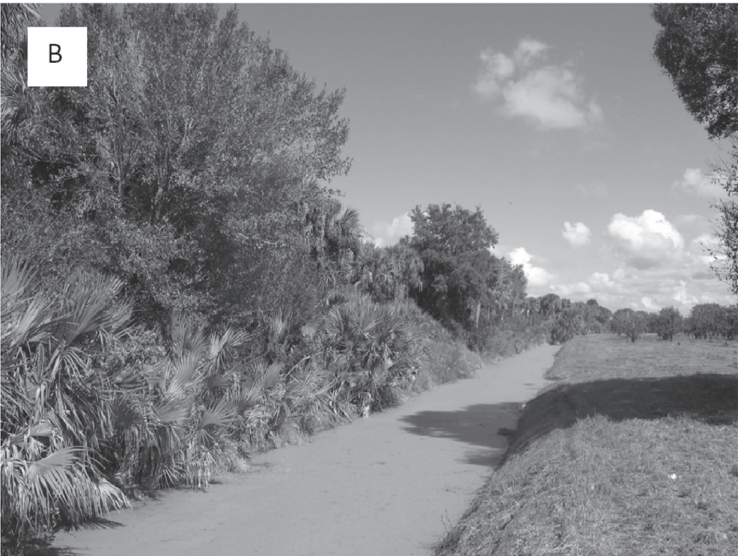
Fig. 1. (A) Map of study site showing transects of traps and sentinel plants, and (B) barrier of trees and shrubs separating pasture and groves (right).