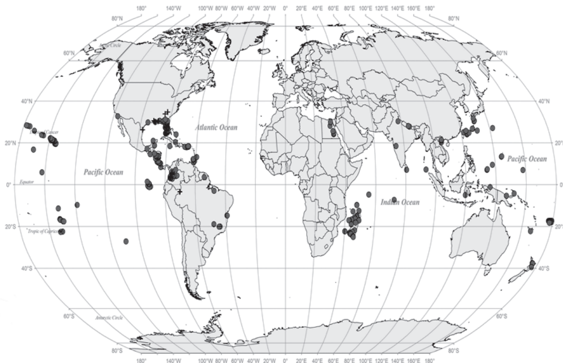
Fig. 2. Worldwide distribution records of Cardiocondyla minutior . Circle = C. minutior record. + = unconfirmed New World ' C. nuda ' record.