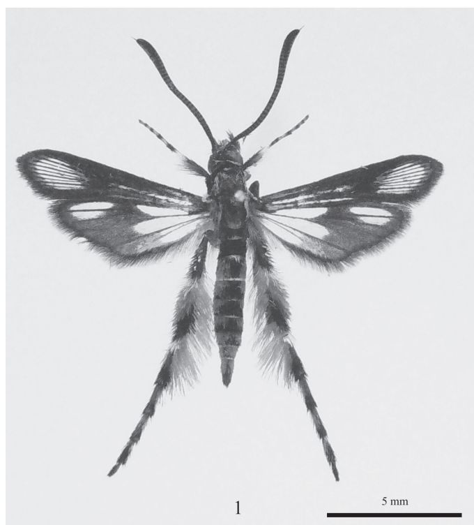
Fig. 1. Male of Pyrophleps bicella Xu & Arita sp. nov.