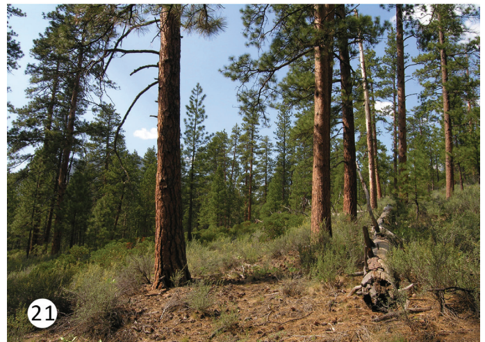
Figs. 20–21. Habitats of Alaus melanops LeConte, 1863 in Oregon, USA, forest of Ponderosa Pine Zone.