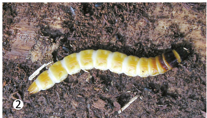
Figs. 1 and 2. Alaus melanops LeConte, 1863. 1, Adult (habitus, dorsal); 2, larva (habitus, dorsal).

Department of Invertebrate Biology, Evolution and Conservation, Institute of Environmental Biology, Faculty of Biological Science, University of Wrocław, Przybyszewskiego 63/77, PL-51-148 Wrocław, Poland