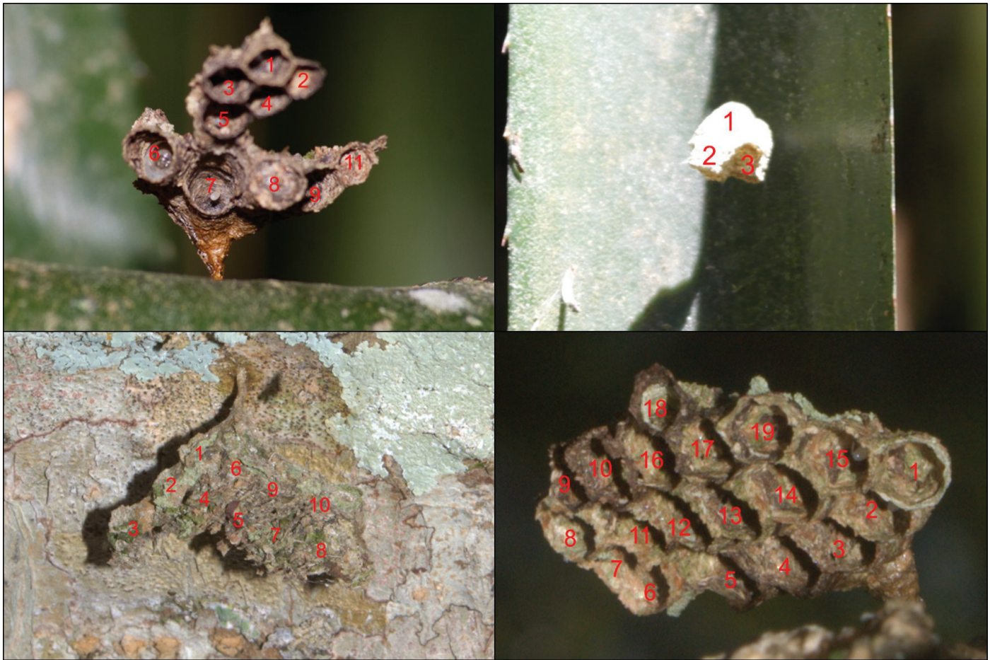
Fig. 1. Construction patterns of Mischocyttarus iheringi nests found in the Botanical Gardens of the Federal University of Juiz de Fora, Brazil, showing the number of cells.

iheringi , which leave the nest during a disturbance and do not exhibit stinging behavior similar to that displayed by most species of social wasps.