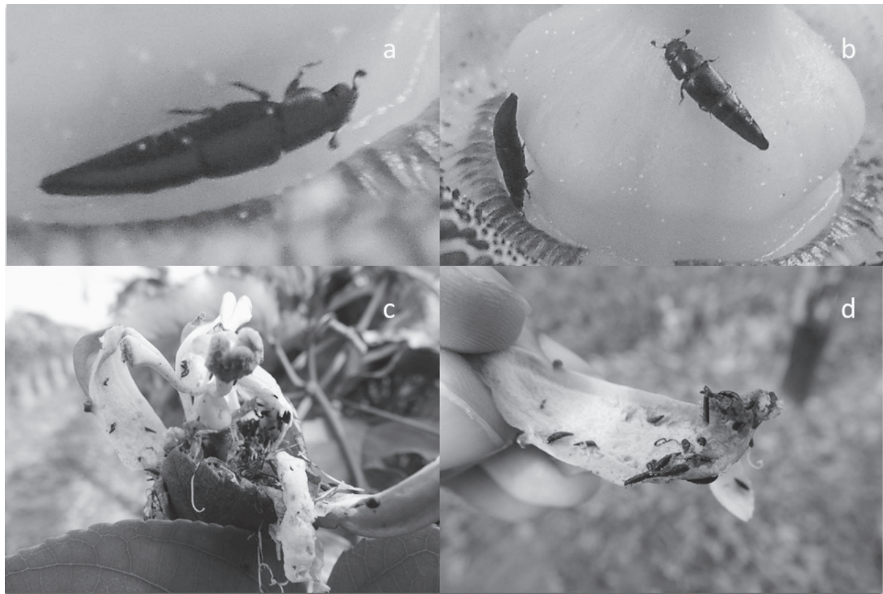
Fig. 1. Adults (a, b) of Conotelus sp. (Coleoptera: Nitidulidae) and damage (c, d) caused by this species in passion fruit flowers ( Passiflora edulis f. flavicarpa ).