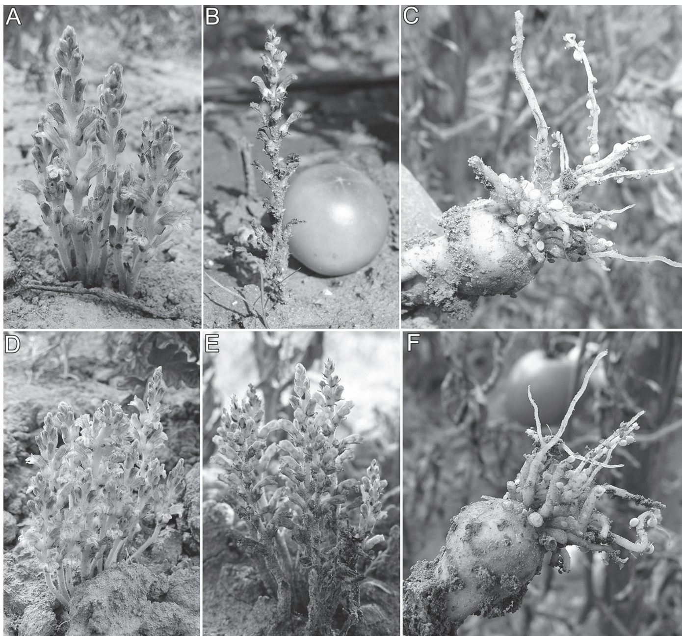
Fig. 1. General habit of the holoparasitic broomrape Phelipanche ramosa : noninfected plant (A, D), plant weakened by aphids infection (B, E), Smynthuroides betae feeding haustoria of broomrape (also visible are Lasius sp. ants) (C, F).