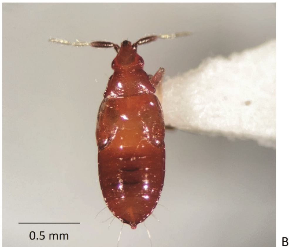
Fig. 1. (A) Dorsal view of a point-mounted adult specimen of Montandoniola confusa collected on Brazilian peppertree in an outdoor garden plot in Davie, Broward County, Florida, USA, on 2 Feb 2020; (B) dorsal view of a point-mounted late nymphal instar specimen of M. confusa collected in an indoor thrips colony rearing cage on 20 Aug 2021.