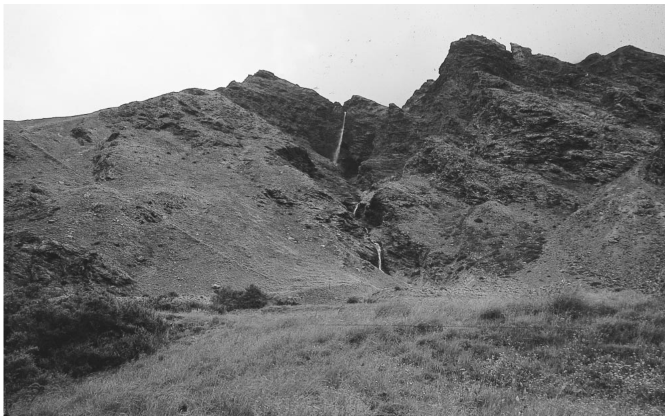
FIGURE 2 Alpine meadows above the timberline contain a great variety of flowering plants, including medicinal herbs.

Recently, rearing sheep and goats, practicing agriculture on marginal lands, and the production and sale of woolen articles have been major occupations among the Bhotiya .