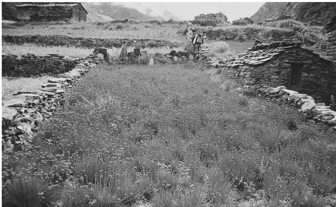
FIGURE 3 Cultivation of Pharan ( Allium carolinianum ) on an agricultural field.

centuries (Atkinson 1882). They are propagated through bulbs and their leaves are harvested twice a year, during June–July and September–October. However, the commercial cultivation of medicinal herbs in the villages studied is a relatively recent development that began about 5 years ago.