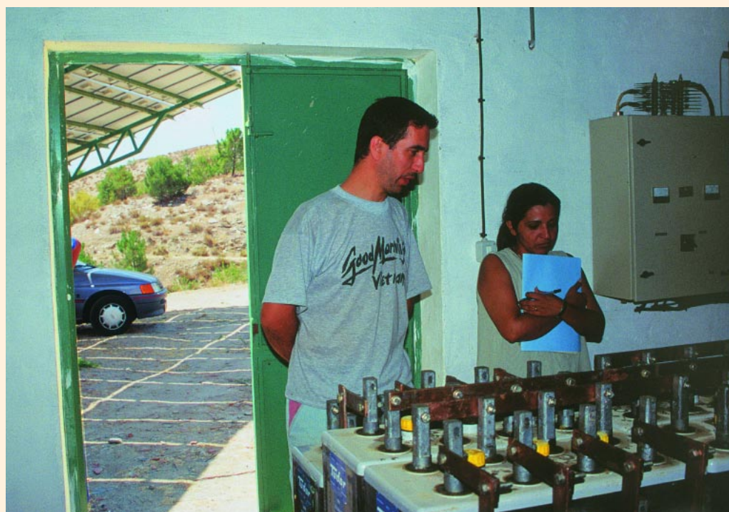
FIGURE 4 The stand-alone village power system of La Rambla del Agua in Spain was financed by the local authorities, the European Commission, and the users. A local and a regional users' association (Virgen de la Piedad and SEBA) are in charge of management and maintenance. Productive capacity (10 kWh) caters to the needs of 40 households.

For us, it is important to have support for maintenance and repair, although we do the most basic things ourselves. If something happens, we can count on our user association. This gives us the confidence we need. (Spanish user, July 1999)