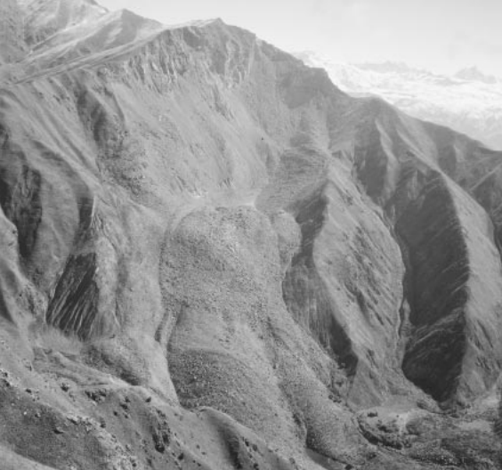
FIGURE 3 Aerial view of the point of initiation of the July 1949 landslide. This view clearly shows that a large part of the upper mountain slope was discharged, with debris tumbling down the valley for more than 12 km, destroying not only Khait but many small villages as well.

air wave, such as would be generated by a powerful explosion, preceded the stone jumble and smashed fleeing people. All other sounds were drowned in the booming rumble of the unimaginable rock storm. In a matter of minutes, Khait had ceased to exist. A tangle of stone hills, 40–60 m in height, was all that remained. The rock stream had choked the riverbed of the Yarchich for hundreds of meters and, like a stone wave, had rolled up the opposite valley side.