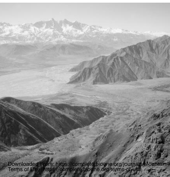
FIGURE 2 Aerial view of the lower Surkhob Valley in the Tajikistan Pamir. The valley floor, from the bottom left almost as far as the main river, is buried under the rock debris that resulted from a massive rockfall and landslide triggered by the major earthquake of 1949. The rock debris covers the former site of Khait, the regional administrative center.

occurrence of large landslides, for instance, that blocked valleys and dammed up ephemeral lakes. Subsequently, some of these lakes must have drained catastrophically. One of the more recent of the landslide lakes is Lake Sarez. It originated following an earthquake that occurred during the winter of 1911 and today is more than 60 km in length and over 500 m deep (Alford et al 2000).