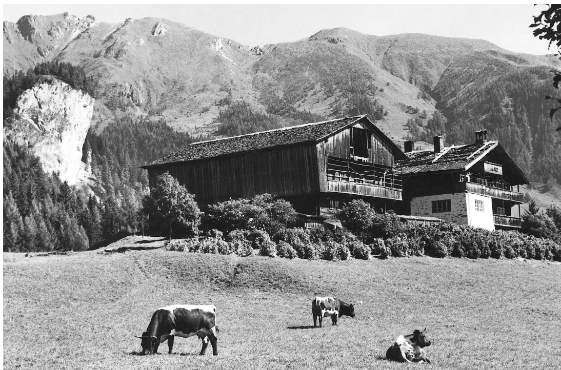
FIGURE 3 These Pinzgauer cattle are one of the few remaining purebred breeds in the Austrian Alps. After many years of decline in the numbers of this breed, Pinzgauers are now internationally sought for freerange cattle production in the Alps. Pinzgauers are good milk and beef producers. Until recently, the Austrian government paid premiums to breeders in accordance with EU regulations on endangered species.

social and economic disparities between disadvantaged and more advantaged regions need to be assessed as well. In this respect, discussions about genetic engineering become part of a general discussion about the future development of marginal regions, increasing regional product awareness, and local identity. Present policies in many Alpine regions seem to support contradictory directions in development, for example, intensification of agriculture and preservation of agricultural biodiversity (Figure 3).