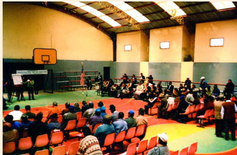
FIGURE 3 Participatory planning in Pucarani is directed by the president of the Monitoring Committee.

Pucarani is organized into rural communities and divided into major and minor agricultural syndicates; original indigenous Andean forms of organization have been lost. The syndicate form of