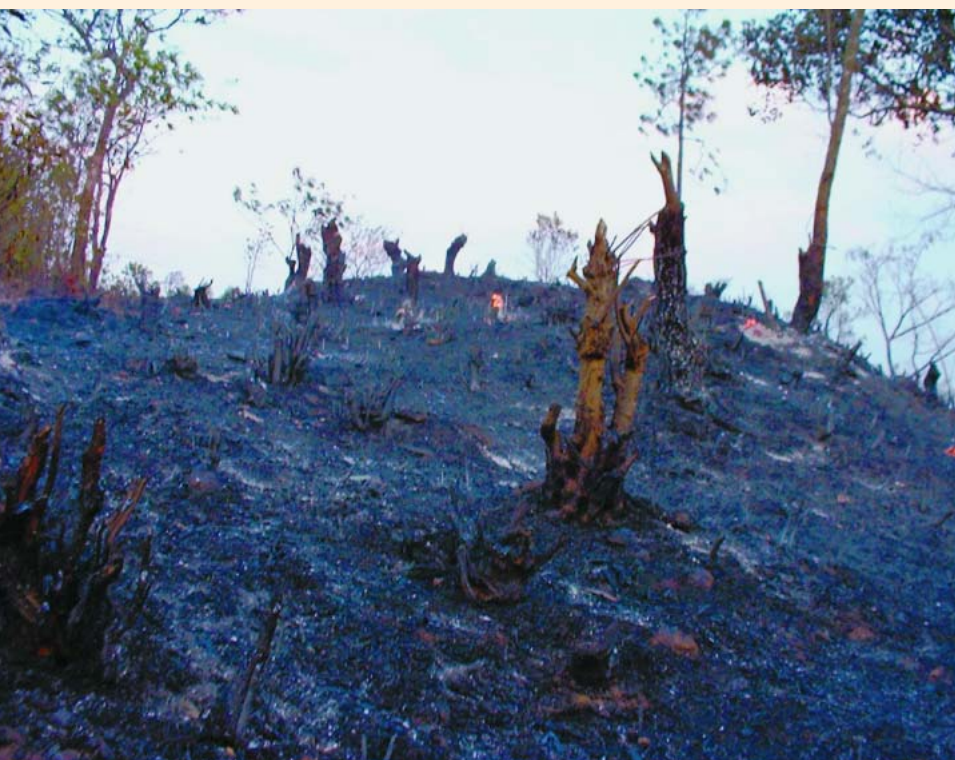
FIGURE 2 The “fast food outlet of Meso-America”: slash-and-burn agriculture in the dry Pacific woodlands of Cololaca, Lempira, Honduras. Though burning makes nutrients readily available for the next year’s crop, the cost is high, as eventual loss of nutrients is valued at US$ 395 per ha per fire.

The rural poor feel obliged to accept this system and in return demonstrate their political loyalty because they do not have the confidence that they can feed themselves nor do they even have access to land. Under these conditions, decentralization will only transfer power from national to local caciques . This will lead to further fragmentation of a weak state instead of democratizing decision making and replacing the predominant systems of patronage.