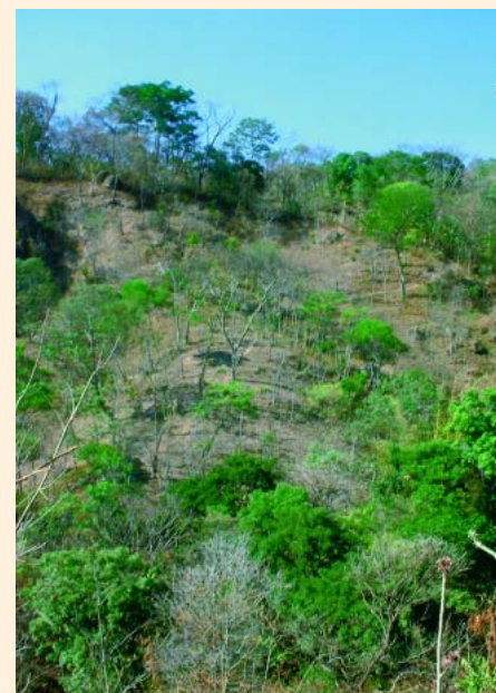
FIGURE 3 Dry Pacific forest in Candelaria, Lempira, under agroforestry management. A maize crop was harvested from this land 1 year earlier. Under agroforestry, yields are twice as high as with slash-and-burn and are sustainable.

The Lempira Sur project started with a problem of food insecurity. Ensuring food security remains a high priority, but the project has had to invest heavily in building institutions to promote good governance. After 4 years, the results were visible. But institution building would not have been so successful had the project not invested heavily in changing the local systems of production at the same time. The local population has now gained confidence and