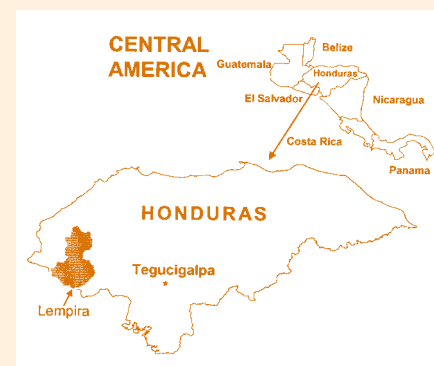
FIGURE 1 Location of the Department of Lempira in Honduras.

Social and political change depends on changes in the predominant land use systems, that is, slash-and-burn agriculture and extensive cattle ranching. Although the former is a system inherited directly from the Meso-American maize culture and differs greatly from the latter, which is a Spanish import, the two systems are now symbiotic. A majority of the rural poor cannot feed themselves from their meager plots and thus have to sell their labor to make ends meet. This vulnerability, coupled with their isolation and lack of education, leaves them dependent for their survival on the local intermediaries, who stand between them and the national power structure. These intermediaries control the offices of local government and positions in congress, through which they direct the patronage systems created by parliament and managed by the government of the day.