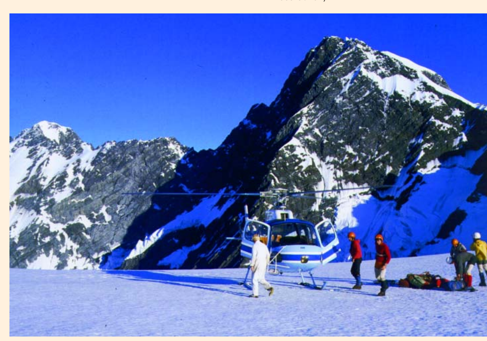
FIGURE 3 A helicopter unloads climbers on Faith Col. Mt Hopkins behind.

Much filming of the movie Vertical Limit occurred in the park, with extensive use of helicopters, including in the Hooker Valley.