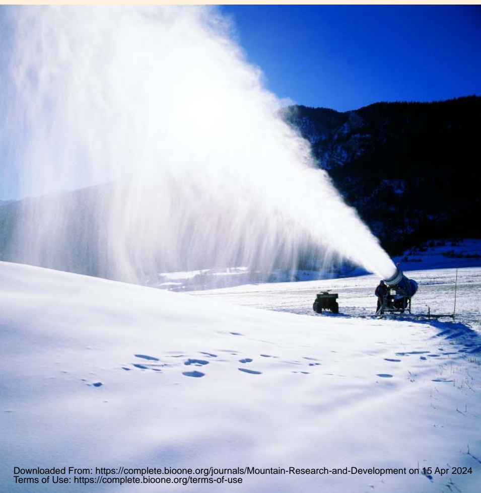
FIGURE 4 Snow cannon: such devices are expensive and can only be used under very specific climatic conditions.

At present, adaptation strategies prevail. One of the best known measures for reacting to uncertain snow cover levels and snow scarcity is the installation of artificial snow blowers. When it comes to future improvement of mountain transport facilities in winter, modernization of the facilities and extension of artificial snow installations are a top priority. Estimates for the year 2003 predict that artificial snow runs will account for 7.7%, or 1700 ha, of ski runs, totaling 680 km. This is not much by international comparison, however. Artificial snow installations are cost-intensive: Investment costs per km for artificial ski runs are about US$0.6 million, and annual operating costs are between US$19,000 and 31,000/km. Moreover, artificial snow production is limited; it is impossible if temperatures are too high. Accessing higher areas for ski tourism may guarantee more snow, but it is linked with a series of problems. This strategy calls for high-level technical investments and is thus cost-intensive due, for example, to permafrost. It entails an expansion of ski tourism into ecologically