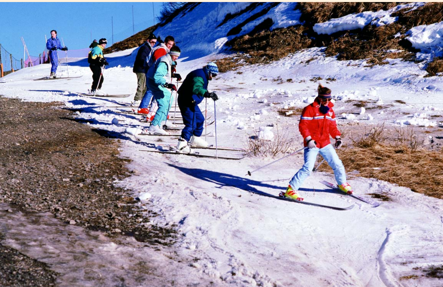
FIGURE 2 Artificial snow was needed to keep this ski field in Termignon (French Alps) functional.

Reliable snow cover—A (Swiss) ski area has reliable snow cover if there is a minimum cover of 30–50 cm (12–20 inches) on at least 100 days in 7 out of 10 winters, from 1 December until 15 April.