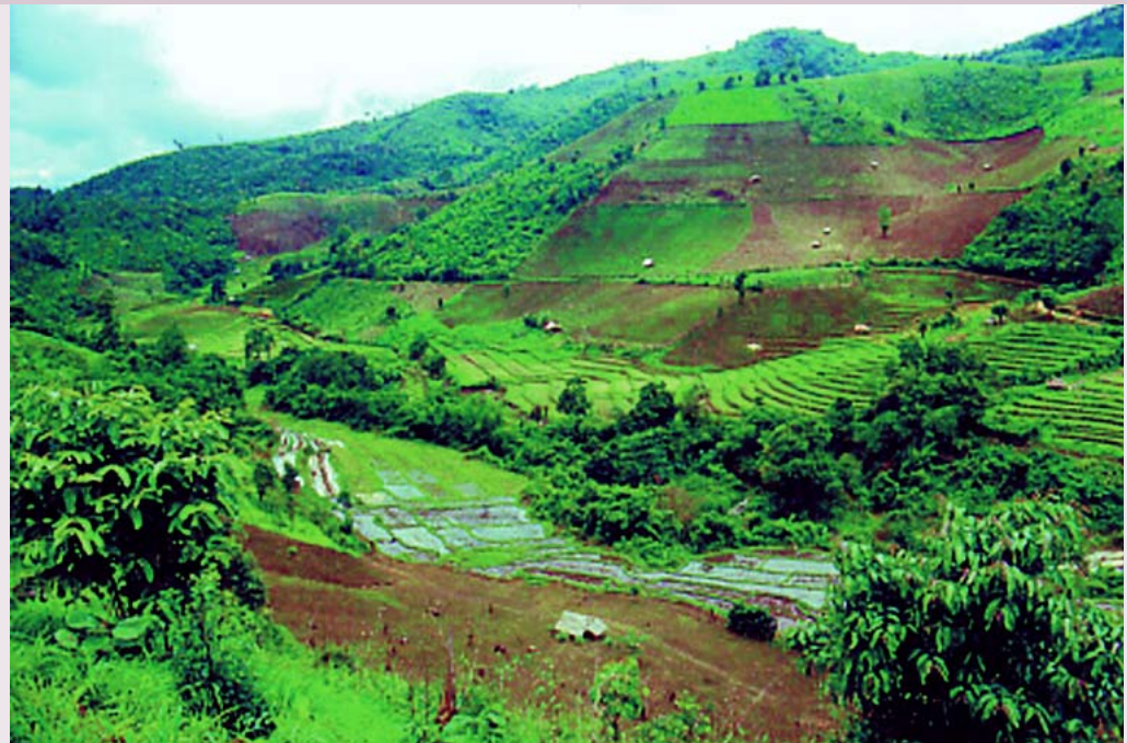
FIGURE 1 A mosaic of mountain land uses: vicinity of Mae Cham village, Chiang Mai, Thailand.

achieved with the help of cropping systems developed and adapted by farmers themselves (Figure 1). Studying farmers' management techniques will allow this success to be repeated elsewhere, but only if it is based on the idea of dynamic variation in cropping system management that occurs within and between mountain agroecosystems, defined as agrodiversity.