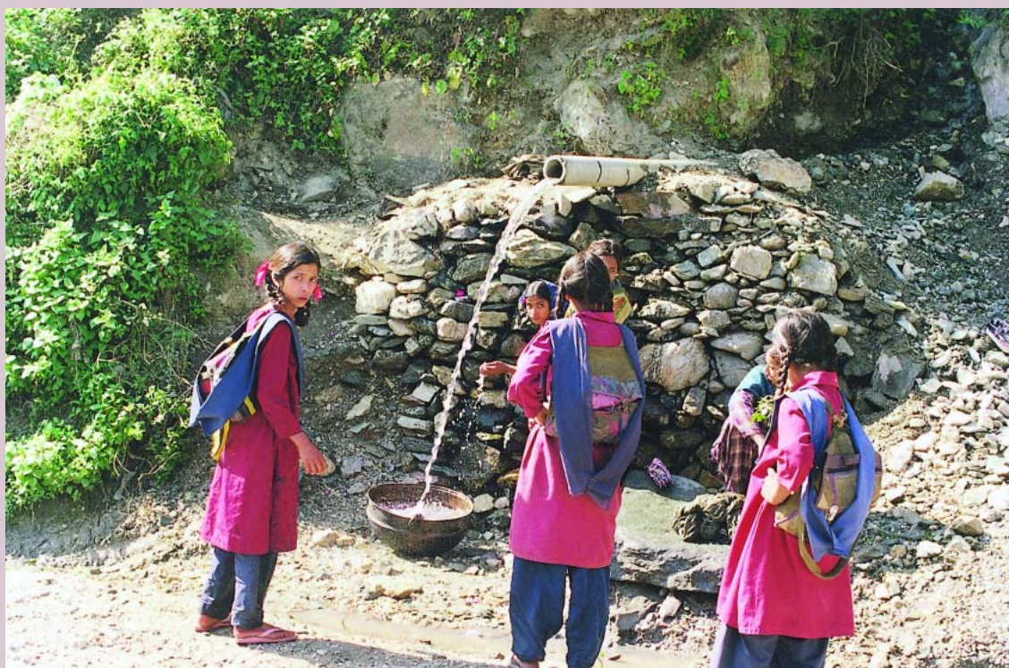
FIGURE 1 Schoolgirls fetching water conducted from a spring by a cement pipe.