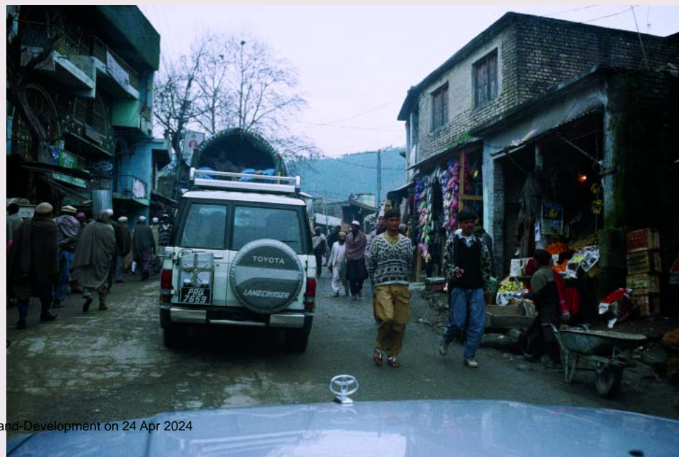
FIGURE 2 With the increase in tourism, the demand for comfortable air-conditioned transport facilities has also increased, at the expense of local transport businesses that cannot afford such costly vehicles.

"We do not get anything out of tourism in our areas. We do only small jobs for daily wages, which we of course could get in big cities. They use our areas and give us peanuts." (Muhammad Ali Khan, Swat Valley, September, 2001)