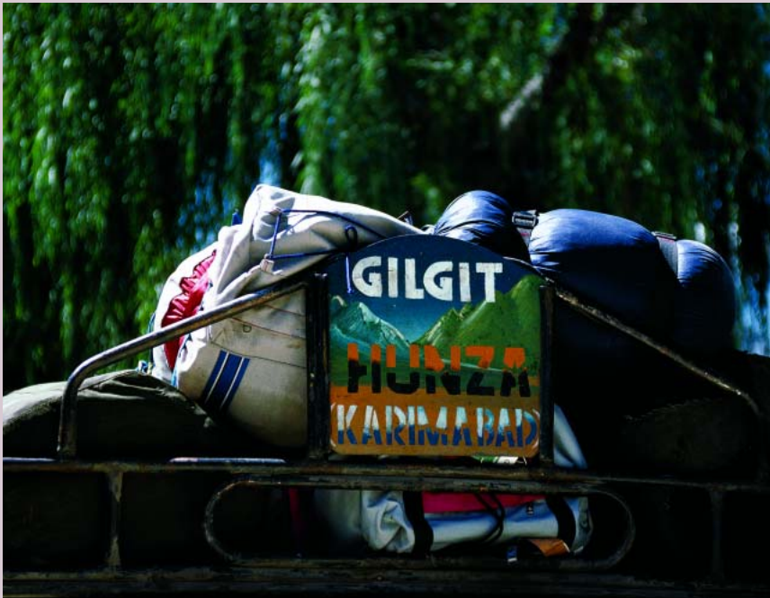
FIGURE 1 International tourists who visit the north of Pakistan no longer use local buses such as this one.

ment, and ecotourism are closely linked. Tourism activities in Pakistan are currently far from sustainable, as in many other mountain regions worldwide: deforestation, uncontrolled land utilization, unplanned growth of tourism, mushrooming growth of accommodations, and, above all, outmigration of young, energetic people as a result of limited job opportunities and lack of local ownership and participation in tourism ventures make change imperative. This paper recommends strategies and measures that urgently need to be developed at all levels.