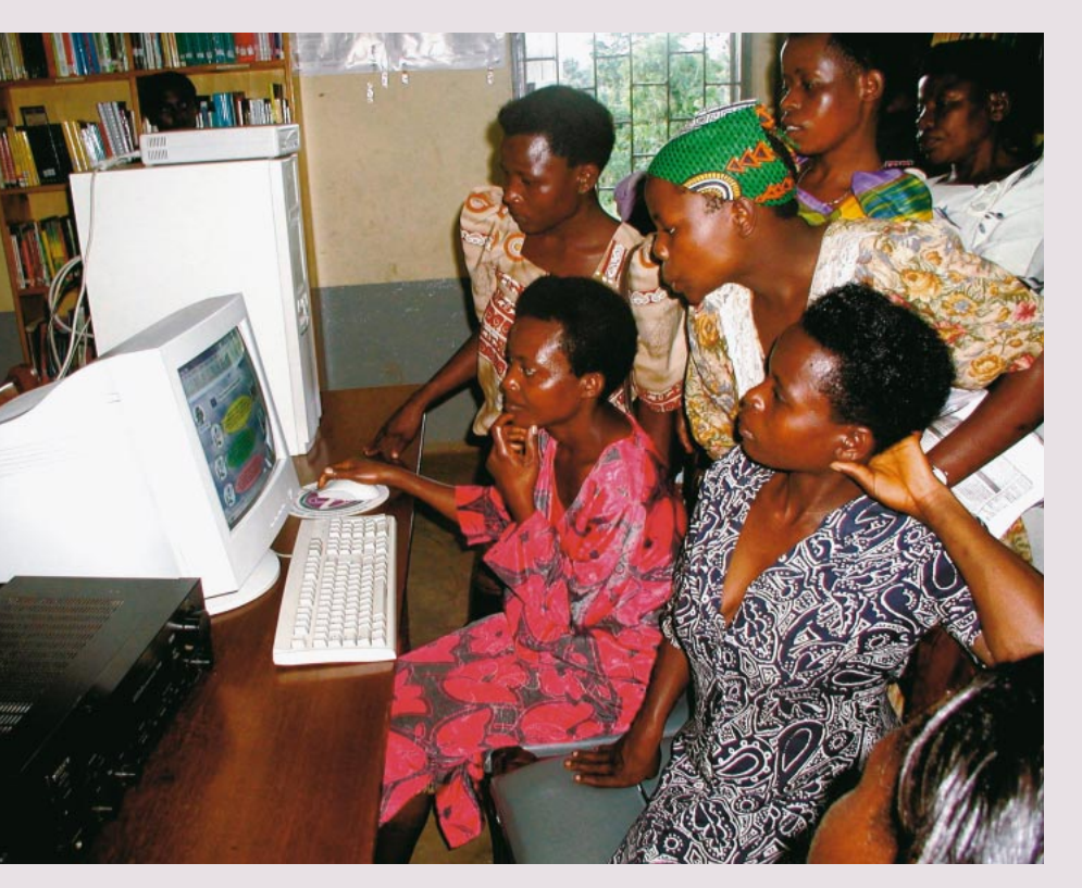
FIGURE 2 Women gather around one of the Internet terminals in the Nakaseke Telecentre in Uganda. These women were accustomed to being laughed at when they approached a computer. Now, they have direct access to the information they need to improve their productivity without relying on an agricultural extension agent, who is most likely a man and who, experience shows, communicates only with men farmers.

goods from Chiang Mai wholesalers, who now deliver the products to the stores. Earlier, retailers had to travel to Chiang Mai themselves to pick up the goods—a journey of half a day or more.