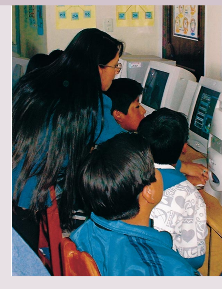
FIGURE 1 Women at the ProMujer Center in La Paz, Bolivia received computer training in a program designed to help young mothers find employment. Now, their young children come to the Center after school, where their mothers can introduce them to computer skills.

With the advent of telephones, local retail stores in highland centers accessible by road are able to phone in orders for