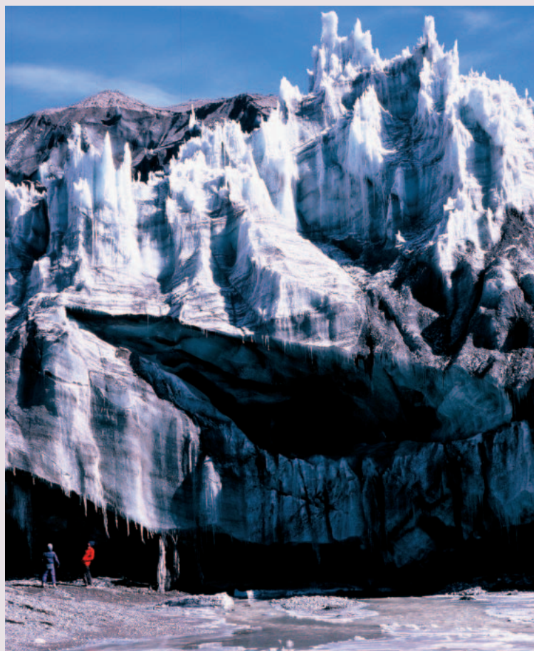
FIGURE 5 A huge ice cave in the Siachen Glacier—a striking visible reminder of the impact of global warming, another major anthropogenic source of risk.

The concept of a Transboundary Peace Park fits in completely with these suggestions, giving a positive dimension to the process. It would work not only toward disengagement but also toward the creation of a park to protect the environment—to allow the ibex, the snow leopard, and the wild roses to return. An informal group of the World Commission on