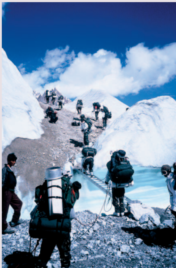
FIGURE 3 Indian army soldiers crossing a bridge on the Siachen Glacier.