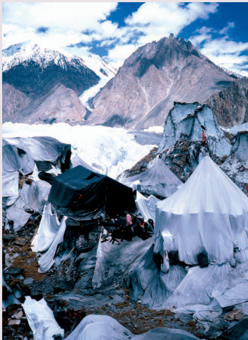
FIGURE 4 An army camp on the Siachen Glacier, showing refuse after days of camping. None of this garbage will be evacuated.

“... surveillance help would also have to include sophisticated airborne radar scanners and night-vision video cameras, such as the Lynx and Skyball systems developed for the Predator unmanned monitoring aircraft that have proved so effective in Afghanistan.” (Selig S. Harrison, in “An American role is crucial,” International Herald Tribune , 12 June 2002)