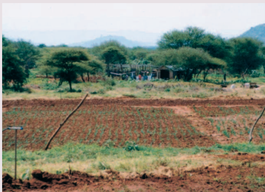
FIGURE 3 Crop production in the marginal pastoral area: the demand for water continues to grow as more marginal areas further north are used for irrigation agriculture.

with ensuing social, cultural, racial, economic, and political disparities, a key challenge is to achieve equitable universal allocation and distribution of river water resources. Further complications of the issue are (1) that people perceive water as a God-given resource—with the implica-