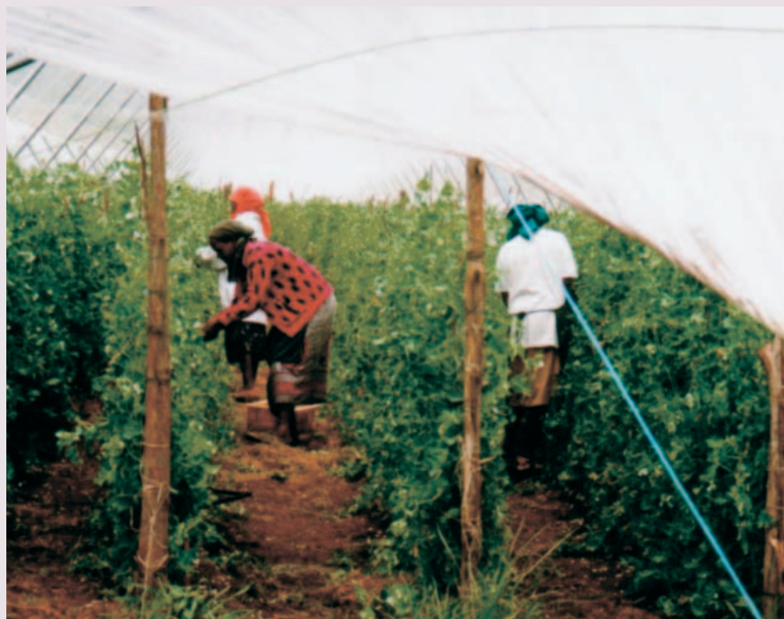
FIGURE 2 Horticultural production: the conversion of former livestock–wheat field systems into large-scale irrigated horticulture in the footzones of Mount Kenya has introduced a new dimension of water demand in the area.

In view of this complex social structure and the rapidly growing population,