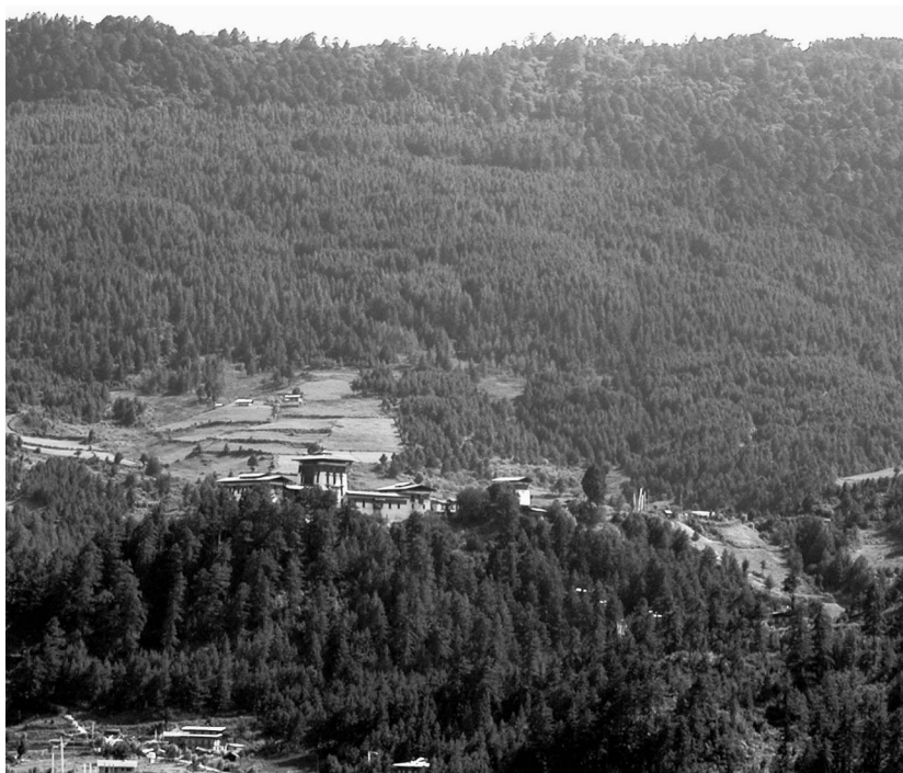
FIGURE 4 Forest cover on the ridges above Jakar dzong (Bumthang district). A mosaic of pastures, cultivated fields, and forests (dominated by blue pine) is seen in the lower part (2700–3200 m). Spruce, hemlock, and fir are found at higher elevations.

combining fast-growing blue pine with dairy production could generate cash returns (annual timber increment and milk value) of US$1000–2000 ha -1 y -1 from land presently used for shifting cultivation. Combining livestock with timber production will generate faster returns than when compared with systems limited to timber production only. Managing systems integrating timber and livestock production will be more demanding than systems focusing on a single output only. Bhutanese livestock producers, however, have convincingly demonstrated that they can manage complicated systems, provided they get the benefit from the outputs produced.