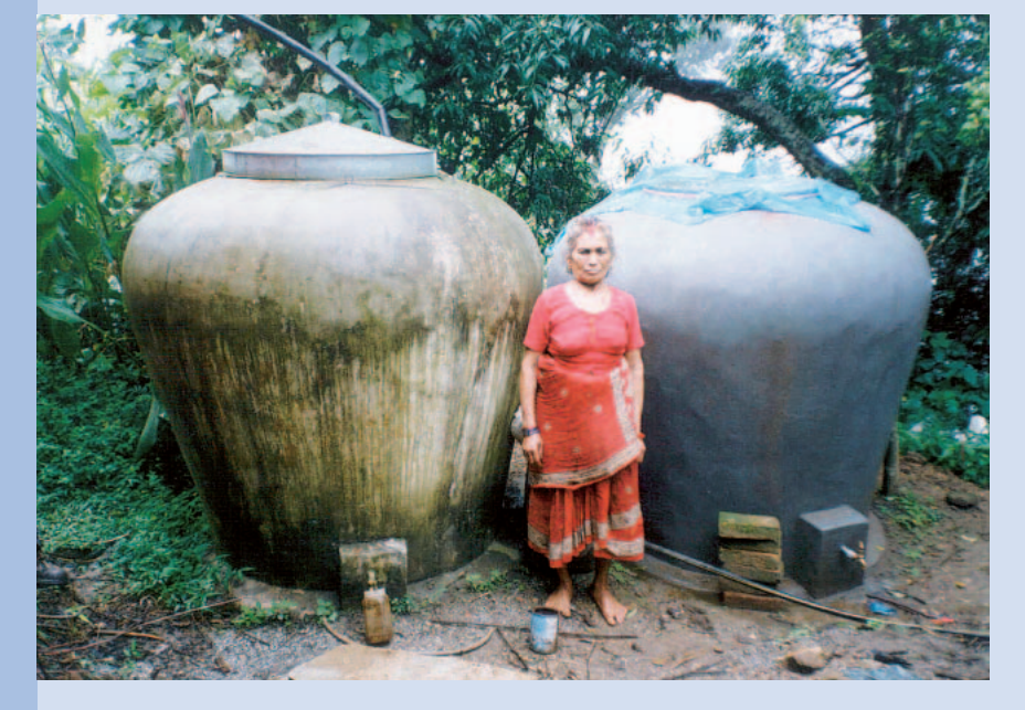
FIGURE 1 A local woman with a project-financed water harvesting jar and a jar financed completely by her family.

Management of water resources on this scale must address supply, demand, and quality from a social and technical point of view. The technical management options may be based on indigenous knowledge and traditional, often forgotten, methods or derived from scientific knowledge. The most important criterion, however, is that any solution to this problem has to be cheap, simple, and farmeroriented in order to be adopted by the population (Figure 1).