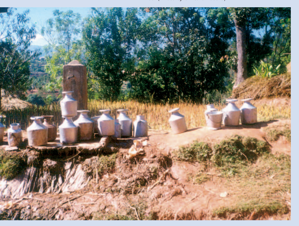
FIGURE 3 Water vessels (gagri) in front of a tap, to be filled.

Middle Mountains but could help to increase water supply, mainly along the ridges in the watersheds and on spurs with no access to springs or streams. PARDYP, in collaboration with the Water Harvesting Project of ICIMOD and RWSSSP, provided hands-on training to local masons in JKW and YKW in the construction of lowcost roof water collection systems. In addition, 13 units were fabricated for demonstration purposes, and another 6 systems were installed at local initiative. According to a study by PARDYP, the main beneficiaries of this technology are women and children because they are largely responsible for collecting water for household use and for animals (Figure 3).