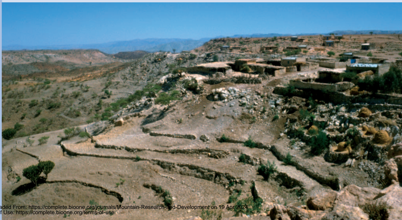
FIGURE 1 Typical farm landscape in the highlands of Eritrea.

Several terms are widely used for drip irrigation: localized irrigation (United Nations Food and Agriculture Organization, FAO), micro irrigation (International Commission on Irrigation and Drainage, ICID), and trickle irrigation