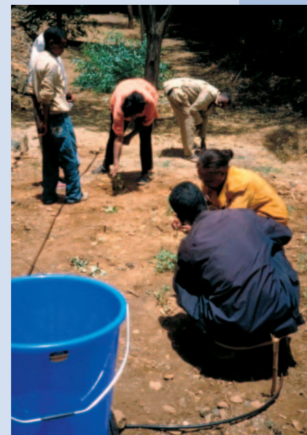
FIGURE 5 Successful use of drip irrigation depends on support from specialists for installation and maintenance.

Last but not least, introducing a new technology means a change in the land use system; therefore, capacity building is essential.