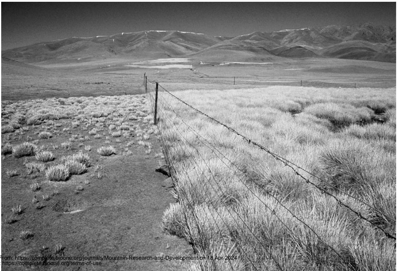
FIGURE 4 The fencing of swamp grassland in Naqu, Tibet, represents a case of a collective tenure and management regime. Household access to the fattening pastures resulting from such an arrangement is effectively controlled by the collective.

The Naqu County government of the TAR, with financial support from the Tibet Poverty Alleviation Fund, has established a number of fattening pastures that have been formally contracted to the village (either administrative or natural) as a whole. The location of boundaries was decided through consultation with com-