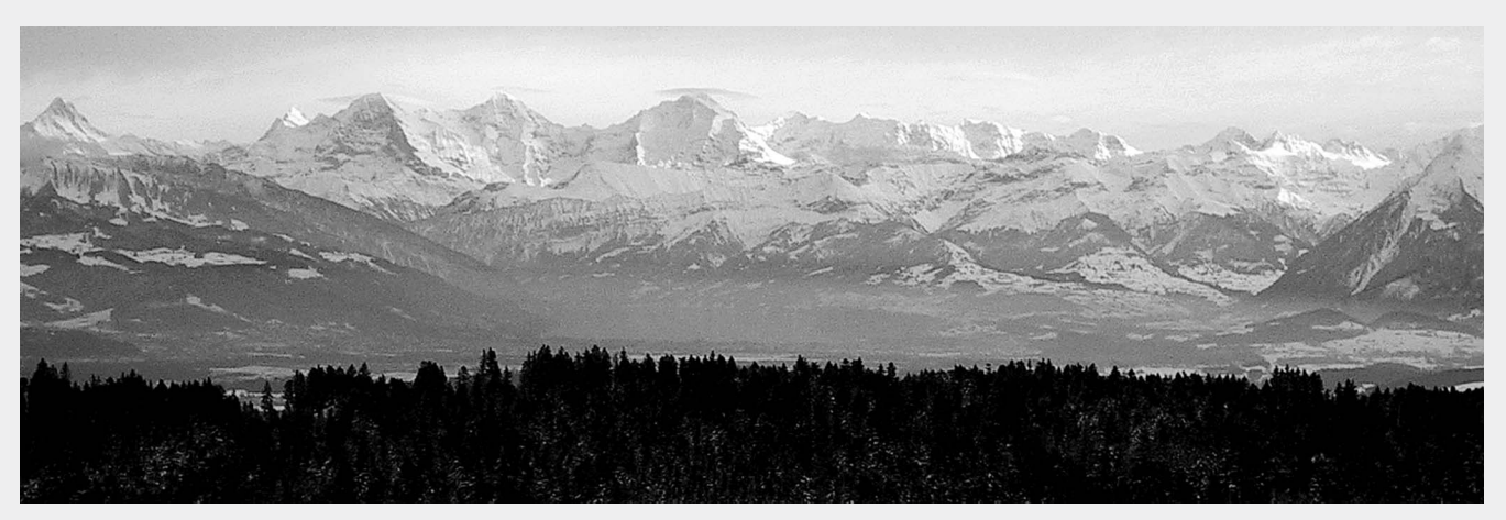
FIGURE 1 November snow on the Jungfrau-Aletsch-Bietschhorn World Heritage Site in Switzerland; view from the northwest.