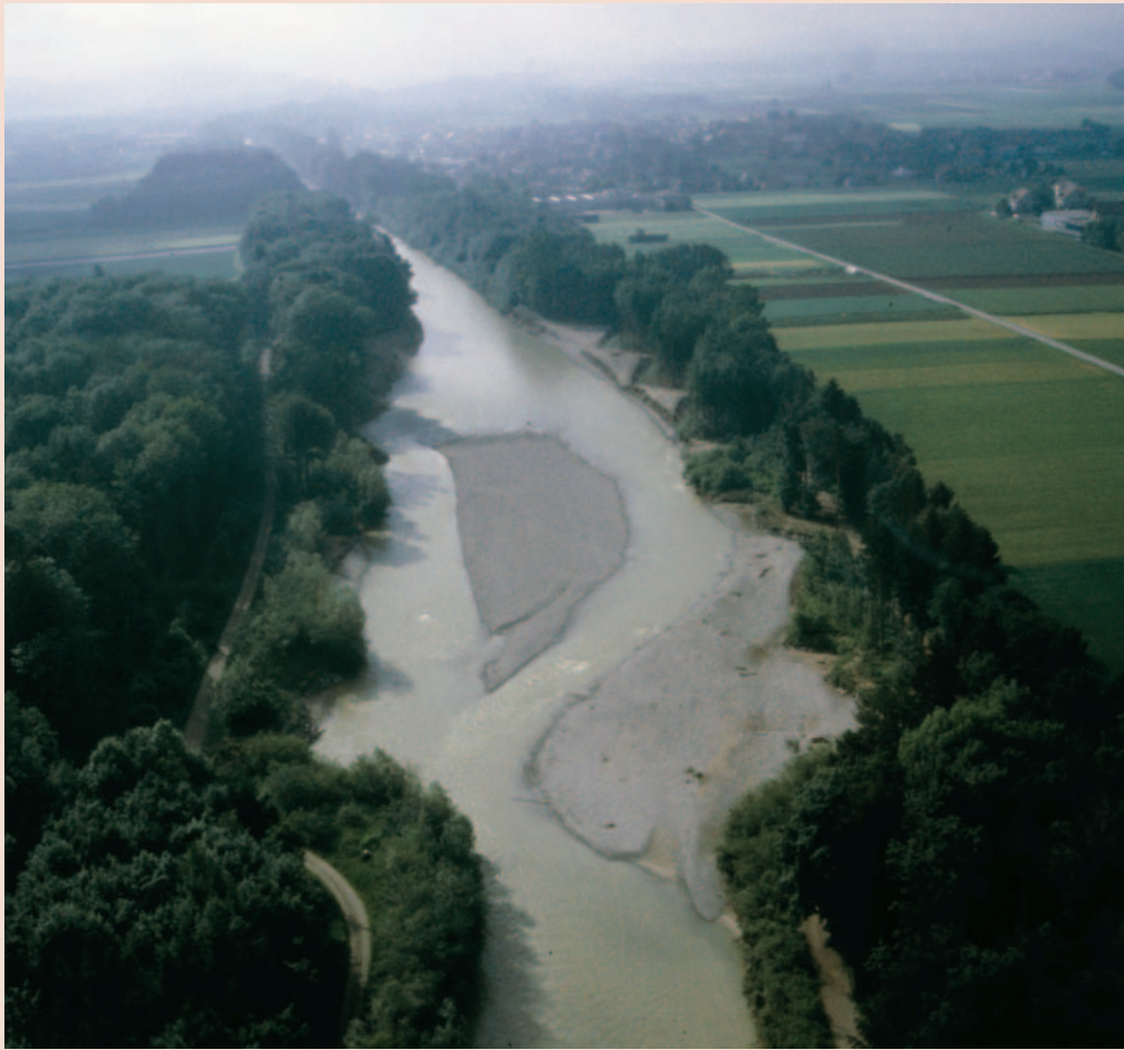
FIGURE 3 The result of a “Space for Rivers” initiative in Switzerland: the resilience of the Emme valley to flooding has been increased by allowing part of the Emme to return to its natural riverbed. This structural measure is cost-efficient, protects the river against undesired influx (thus improving water quality), helps conserve a natural ecosystem, and improves the quality of recreation areas. View of the Emme near Utzenstorf.

rather than certainties. Both the Netherlands and Switzerland offer good examples (“Space for Rivers” initiatives) of stakeholder-driven collaboration between society and scientists that is developing innovative approaches to flood hazards (Figure 3). Recognizing that engineered solutions cannot deliver full flood security, these programs allow experimentation with new policies and practices that increase society’s resilience to floods and