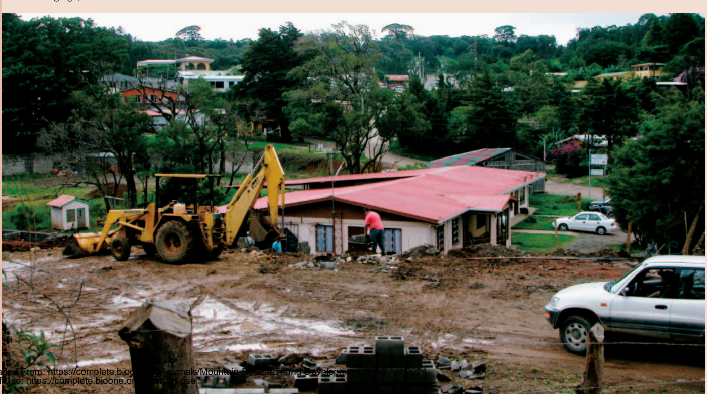
FIGURE 1 Uncontrolled urban development in the Monteverde area.

After Independence in 1821, agriculture and cattle breeding became Costa Rica's main economic activities. The first settlers in the Monteverde area—farmers from the Central Valley—arrived around 1920 and founded small settlements, taking advantage of the fertile and unexploited land in this mountain area. Thirty years later, Quakers from the USA established a