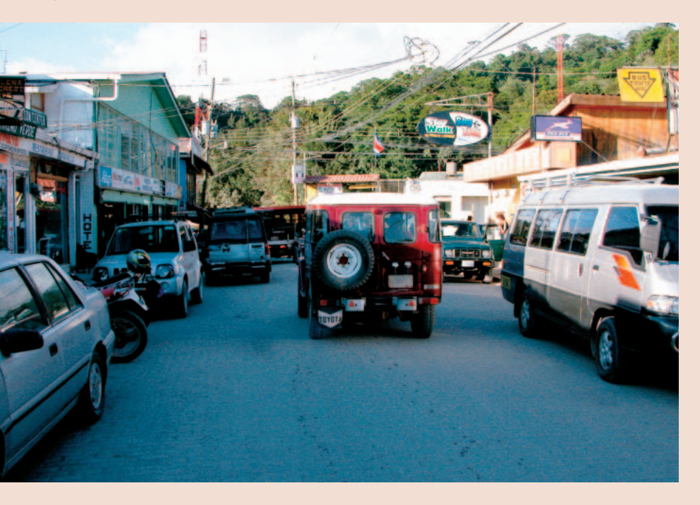
FIGURE 3 The main street of Santa Elena, clogged by tourist traffic that takes up too much public space.

major problem. This is aggravated by the location of the district in an area where 3 different municipalities converge, and by the administrative incompetence of Puntarenas, absorbed as it is by the problems of the central district.