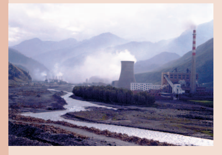
FIGURE 1 Cement plant built in the early 1970s in the mountains south of Urumqi, Xinjiang. The plant provided more than 300 local jobs but is the source of uncontrolled pollution. Distance from the city means there is lack of awareness of this negative impact.

The urbanization process has brought many problems. One is the emergence of landless peasants—a rapidly expanding and weak social group. Indeed, large-scale urbanization has led to confiscation of large areas of farmland. Although local governments have occasionally provided some compensation, the amount is usually very limited. In some cases, land was the farmers' only source of livelihood; they have become homeless, jobless, and in some cases have lost hope. Another problem is the helplessness of many peasants who leave their home towns in search of casual labor in the cities, but with almost no assurance of income and decent health. These people are the victims of urbanization.