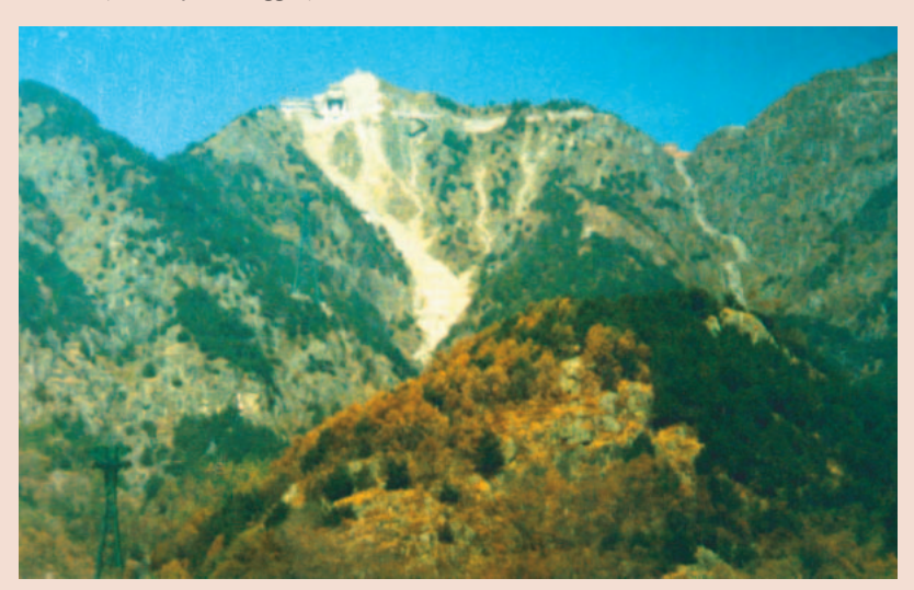
FIGURE 4 Scar (15,000 \text{ m}^2) left by construction of a cable car on the Yueguan peak of Mt Taishan.

connected with the management of parks and heritage sites, with no clear aims and measures. Management of world heritage sites and parks is actually left to local governments, which, in turn, usually rent them to tourist corporations.