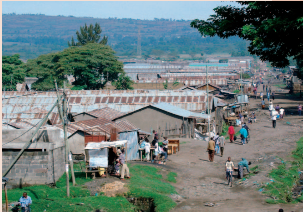
FIGURE 4 The inability of public institutions to cope with rapid urban growth has led to the formation of vast and poorly serviced informal settlements at the southern edge of town. The LUO project now enables stakeholders to monitor urban development according to different criteria, including socioeconomic ones.

level, in a participatory manner (Figure 5), and complemented with statistics from various sources. Community representatives use high-resolution satellite images to map information layers, which are later prepared by the LUO project team for analysis in a GIS environment. Data collected in this manner have a high accept-