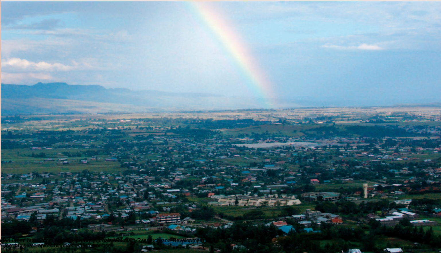
FIGURE 1 Nakuru town in the Bahati Highlands. Located partly outside the municipal boundaries, this part of town is undergoing rapid urbanization at the expense of valuable agricultural land.

On the northern side of town, the Menengai Crater (2490 m)—one of many extinct volcanoes in the Rift Valley, on the