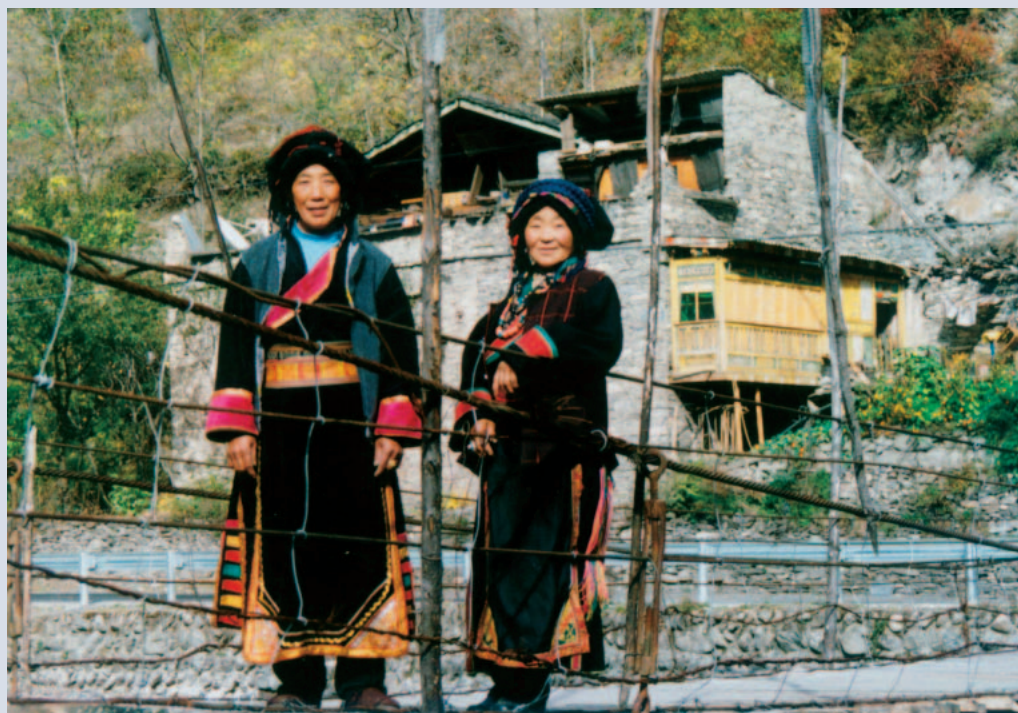
FIGURE 3 These two elderly women belong to the Jiarong Tibetans, whose customs are different from other Tibetans'.