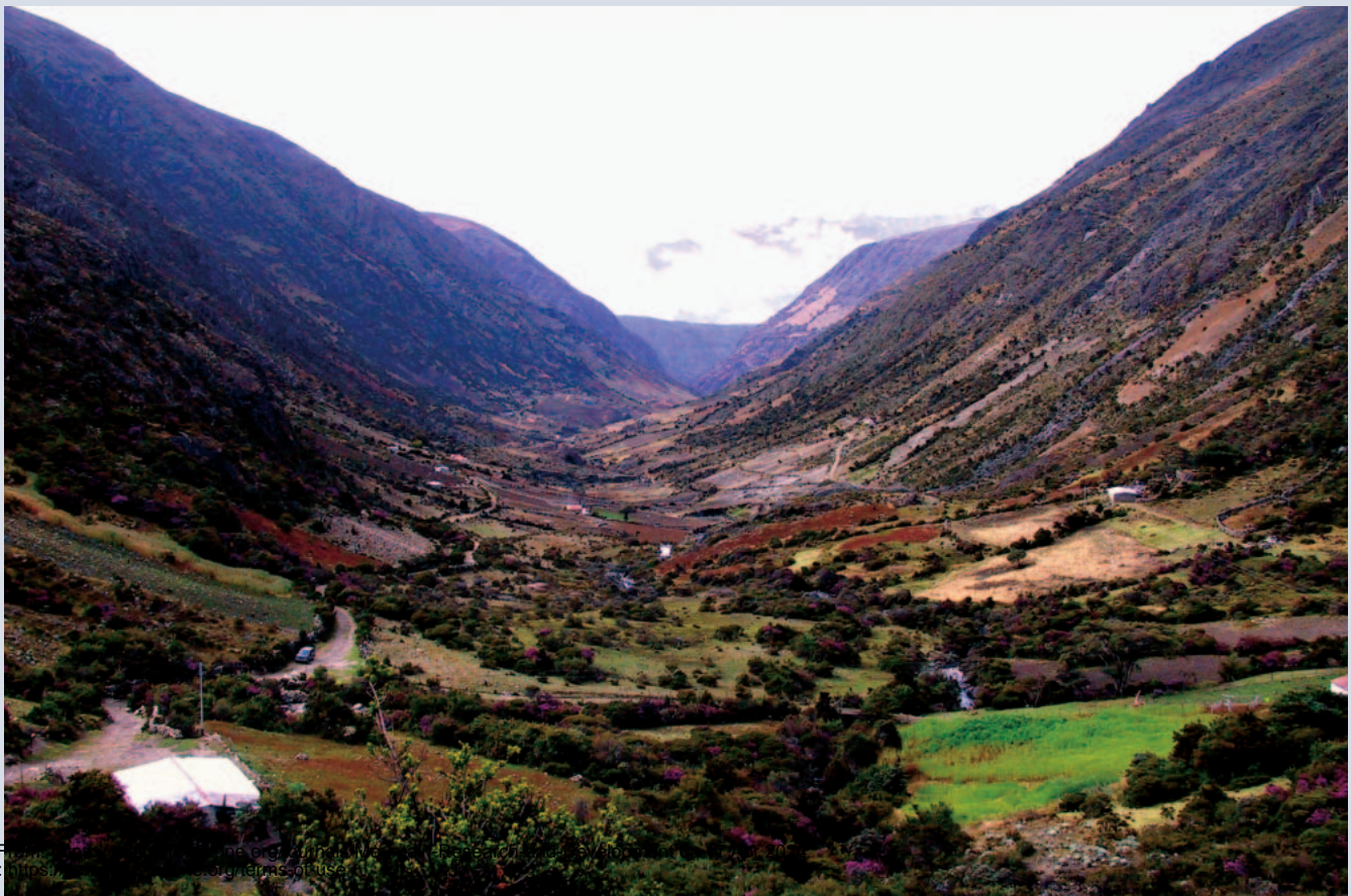
FIGURE 5 Pilot site in Gavidia. Fallow agriculture is practiced to cultivate potatoes. The agricultural zone occupies 19% of the total area (6030 ha) between 3200–4200 m. The 400 inhabitants also depend on extensive cattle raising; some derive their income from tourism. The dominant vegetation is a rosette-shrubland páramo.