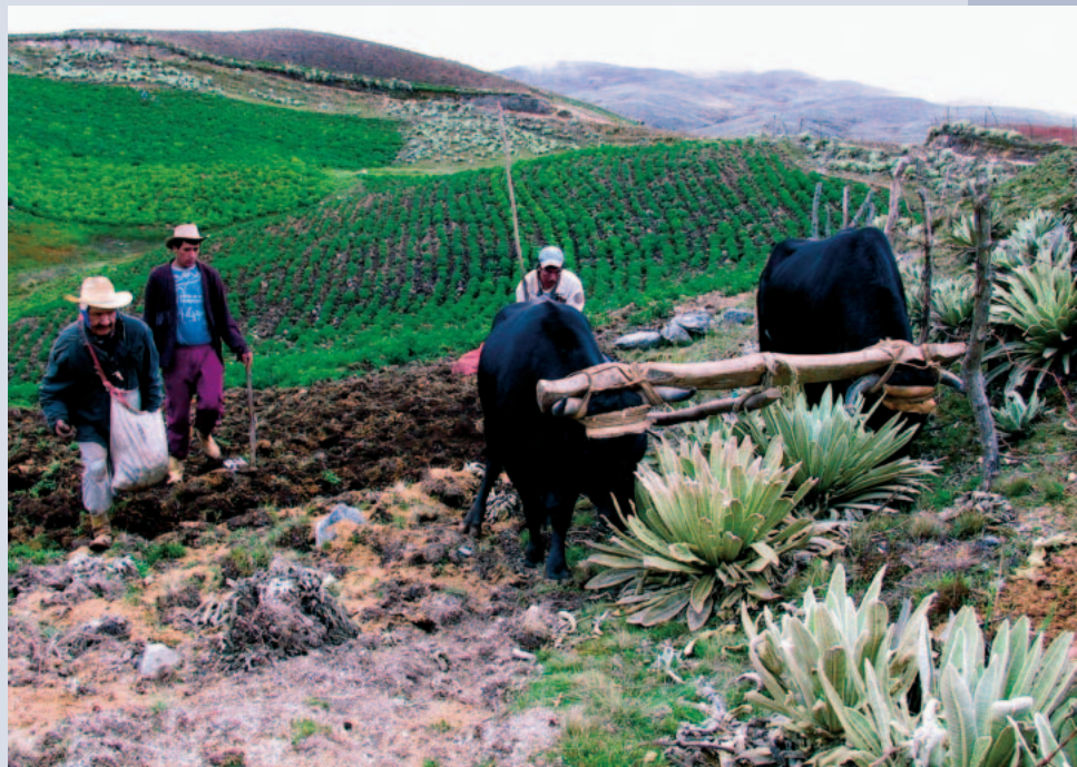
FIGURE 2 Farmers planting potatoes at 3100 m with the help of plows driven by oxen.

in the design of conservation plans. These plans will serve as blueprints for action during project implementation (6 years).