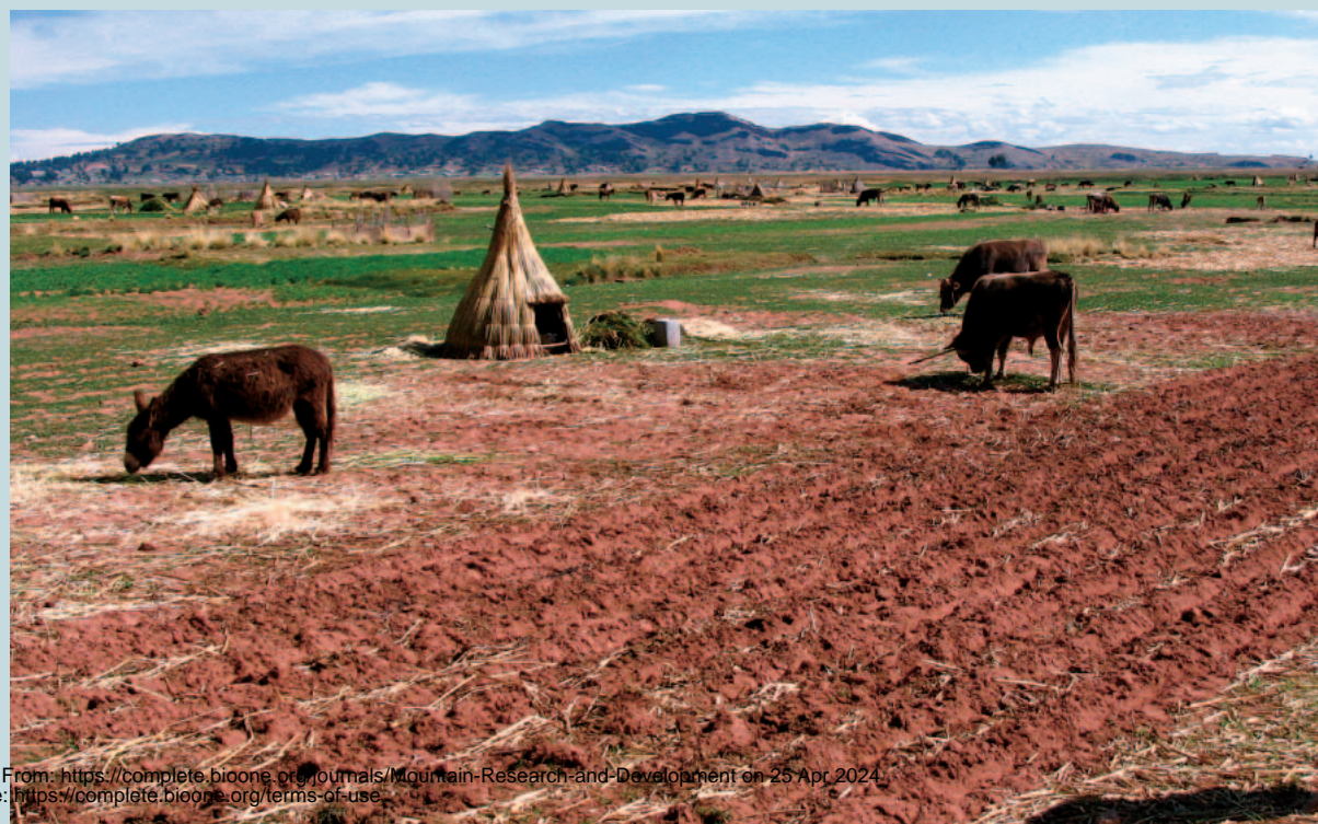
FIGURE 1 The centuries-old land use system developed by the indigenous communities on the Altiplano combines crop and livestock production.

During the last two decades, the International Potato Center (CIP) and its part-