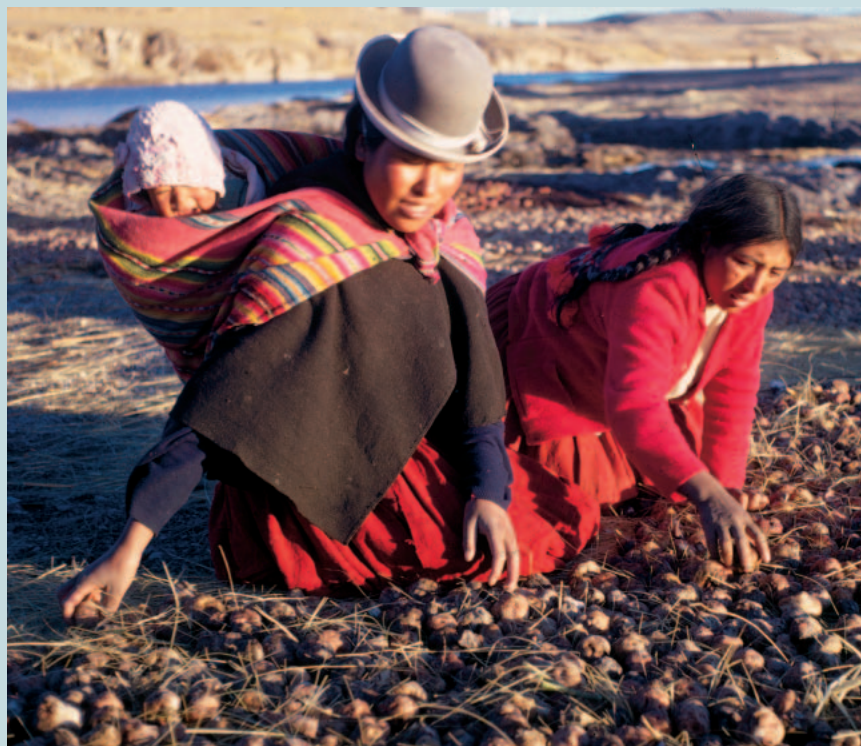
FIGURE 4 Women farmers are key players in ensuring food security.

nerships are strengthened by the utilization of user-friendly decision-support tools and methods, and participatory approaches. CIP and its partners are confident that the approaches and methods proposed in ALTAGRO will help to achieve the MDGs, as they have already been tested in previous projects implemented in 8 peasant communities in the Peruvian Altiplano. ALTAGRO will build on the results of these projects and partnerships to construct a model for the achievement of the MDGs in poor mountainous areas.