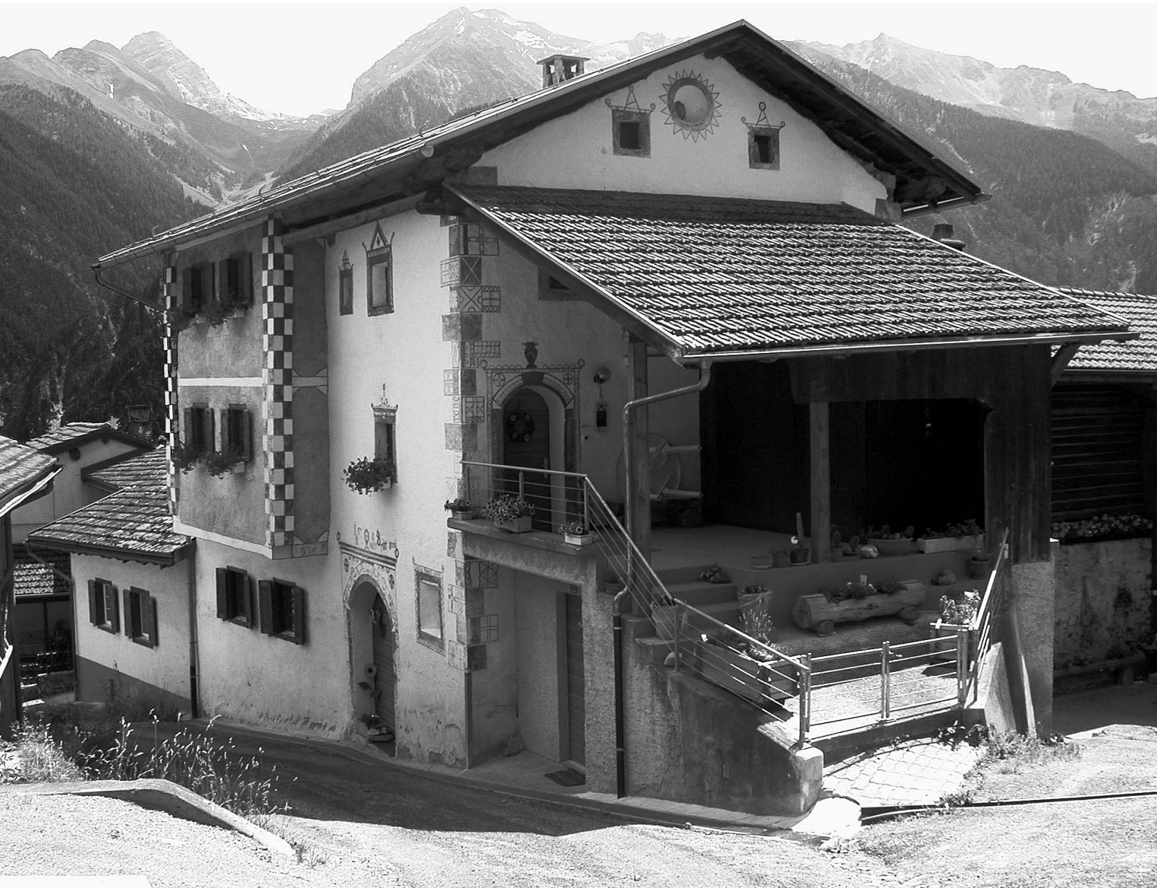
60 FIGURE 4 Construction in a traditional style, typical of Alvaneu.

friends and their common experiences of place. Furthermore, tourists seemed to be particularly satisfied if they got to know local people and especially proud if they established friendly relationships with them. Therefore, the key category personal relationships likewise encompasses individual and social aspects.