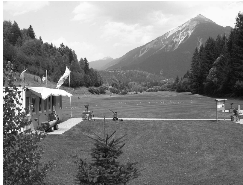
FIGURE 5 Eighteen-hole golf course in Alvaneu Bad.

pole. Some informants nevertheless described how some places became meaningful for them due to personal leisure activities. In their case, the key category remembered leisure activities lies close to the individual pole.